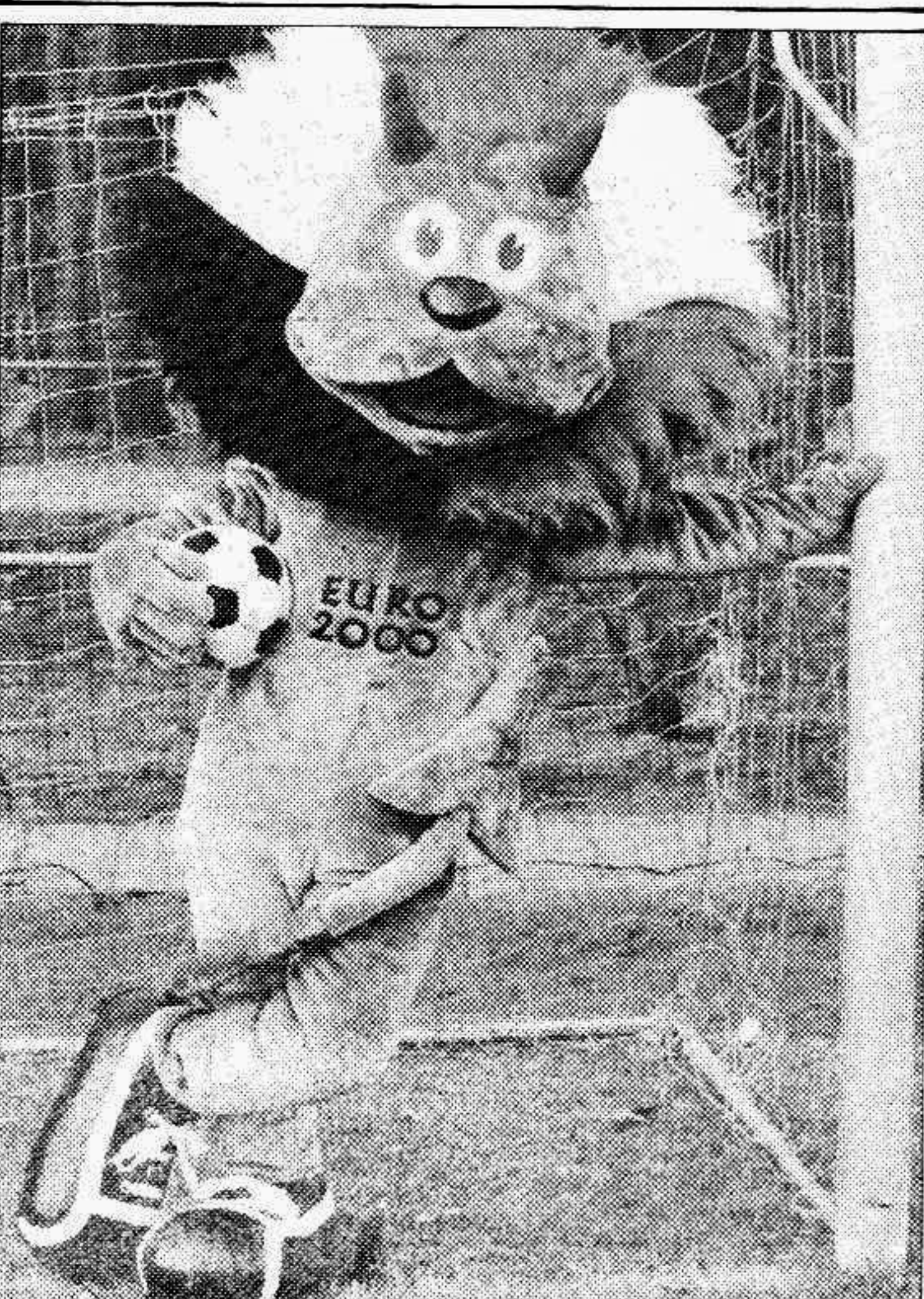
MYSTERY MASCOT: The part lion part devil mascot of European Football Championship 2000 posing for photographers at Zeist, Netherlands on February 6. The mascot is yet to be named.

Colombia also will be playing their first match since last month's earthquake in the Colombian city of Armenia. Proceeds from Tuesday's match will benefit earthquake victims.