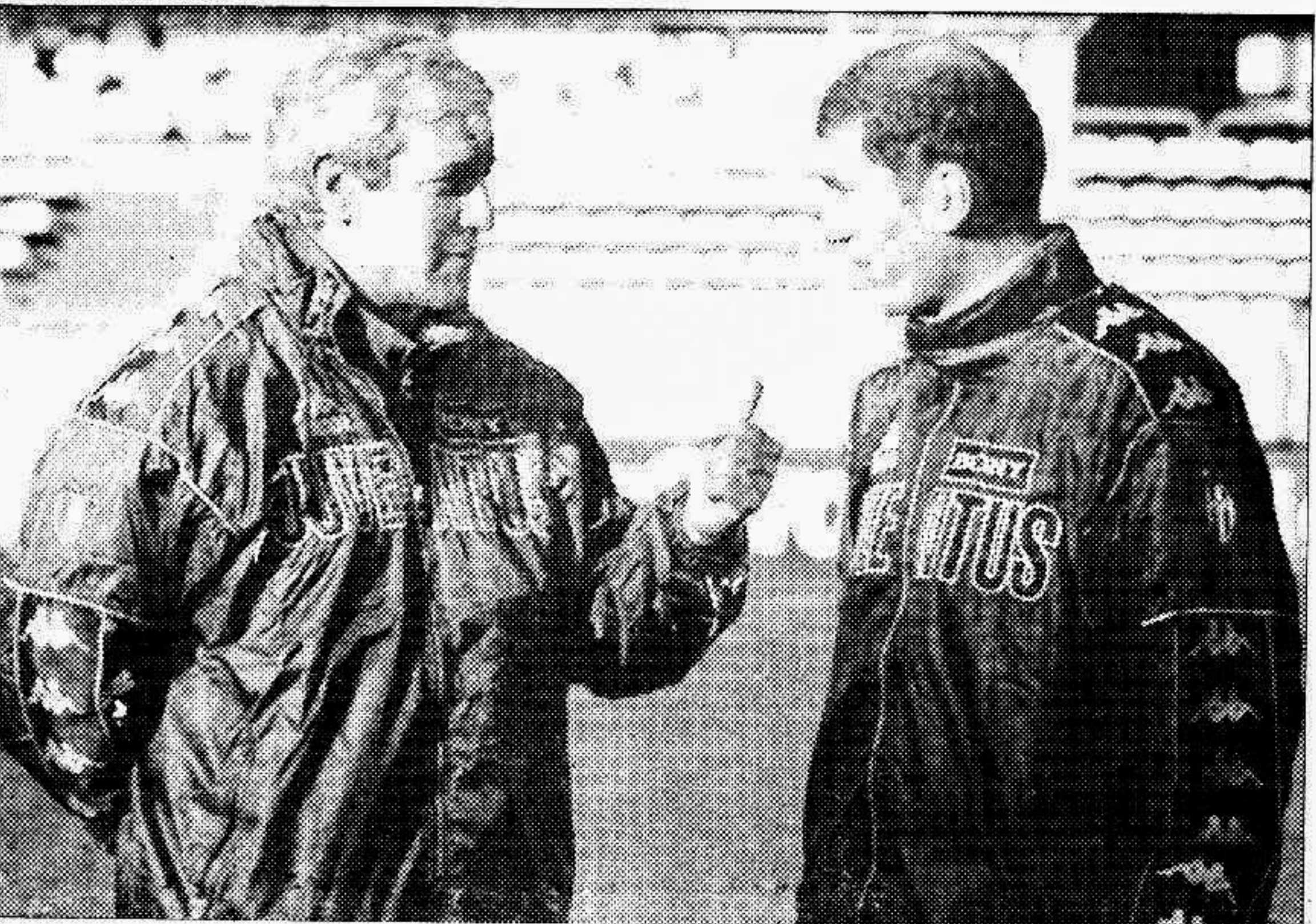
An AFP file photo of Juventus coach Marcello Lippi (L) talking to playmaker Zinedine Zidane during a training session. Lippi announced his resignation on Sunday after Juve's 2-4 loss to Parma in a Serie A fixture at Turin.