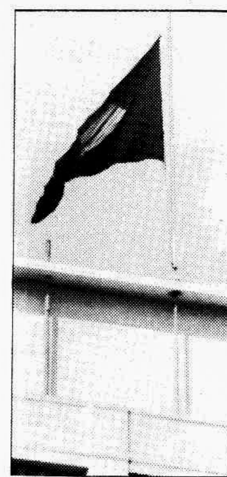
The national flag flying at half-mast atop a government office in the city as a mark of respect to King Hussein of Jordan.

Syria's president Assad, who had refused to see Hussein in recent years, embraced Abdullah and kissed him on both cheeks following King Hussein's burial.