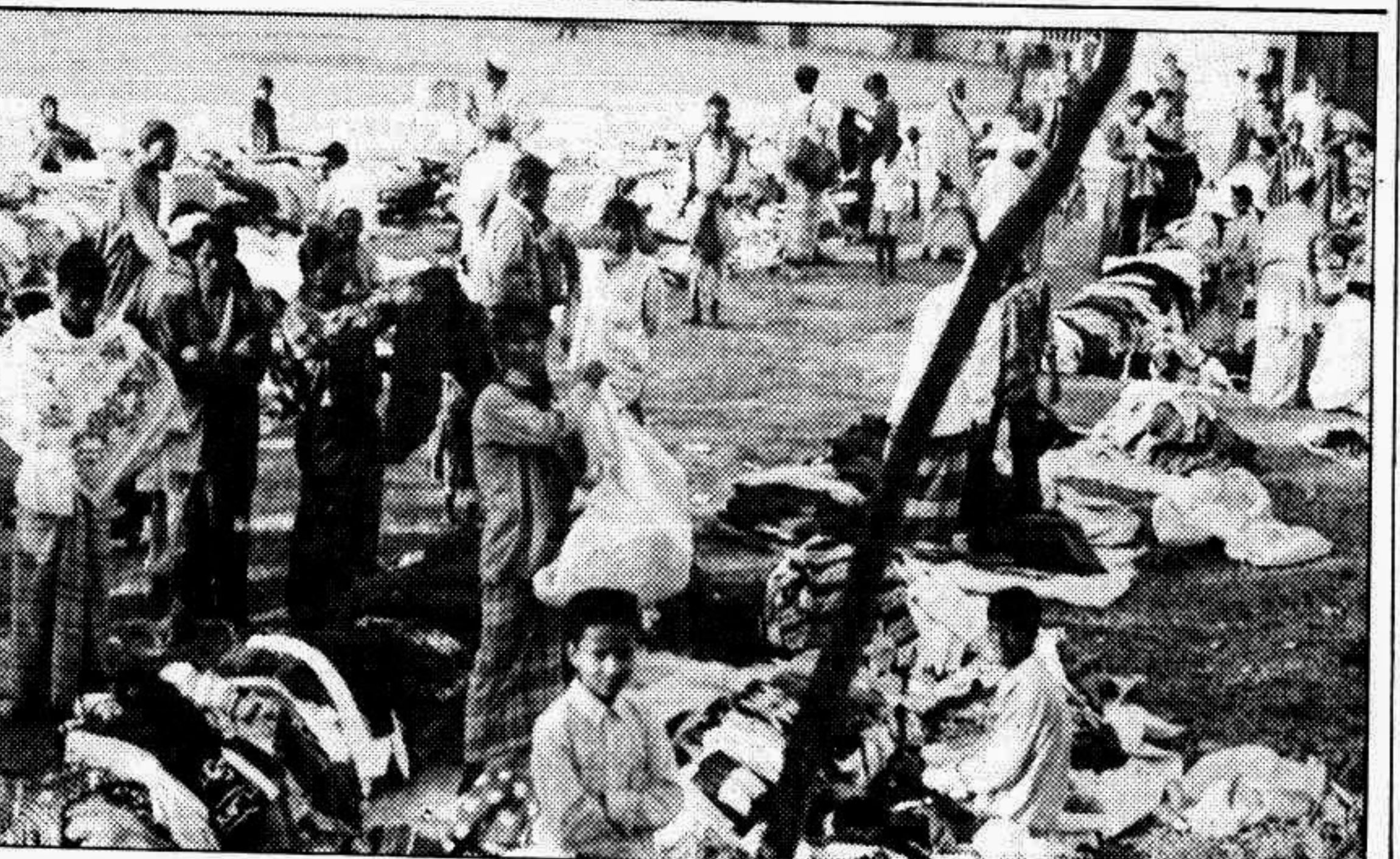
SYLHET: The registry maidan here has been turned into a market of warm clothes. People of low income and lower middle class groups throng here every day to purchase second hand warm clothes at a cheaper rate.

The chief Guest at the seminar, Dr Sheikh Gaus Miah, brought to light seven aspects of preservation of the historic relics. A museum should be set up here in accordance with the proposal of the UNESCO made in 1973, he said.