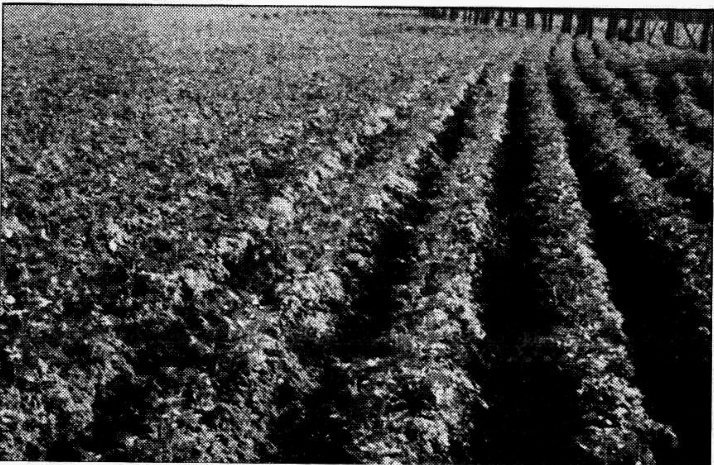
A potato field in Chandpur.

growers are not in a position to store potato for selling in future at a higher price. They are now in need of money to repay their loans and other expenses. So the poor farmers are compelled to sell their products at low price. There are only six large size cold storages in the district for preservation of potatoes. Rich people have already booked these cold storages in advance. Poor and marginal growers find it difficult to preserve potato. The middlemen are now buying potato in bulk and making preparation to store potato in cold storages. They sell these potatoes in the lean period to get much profit.