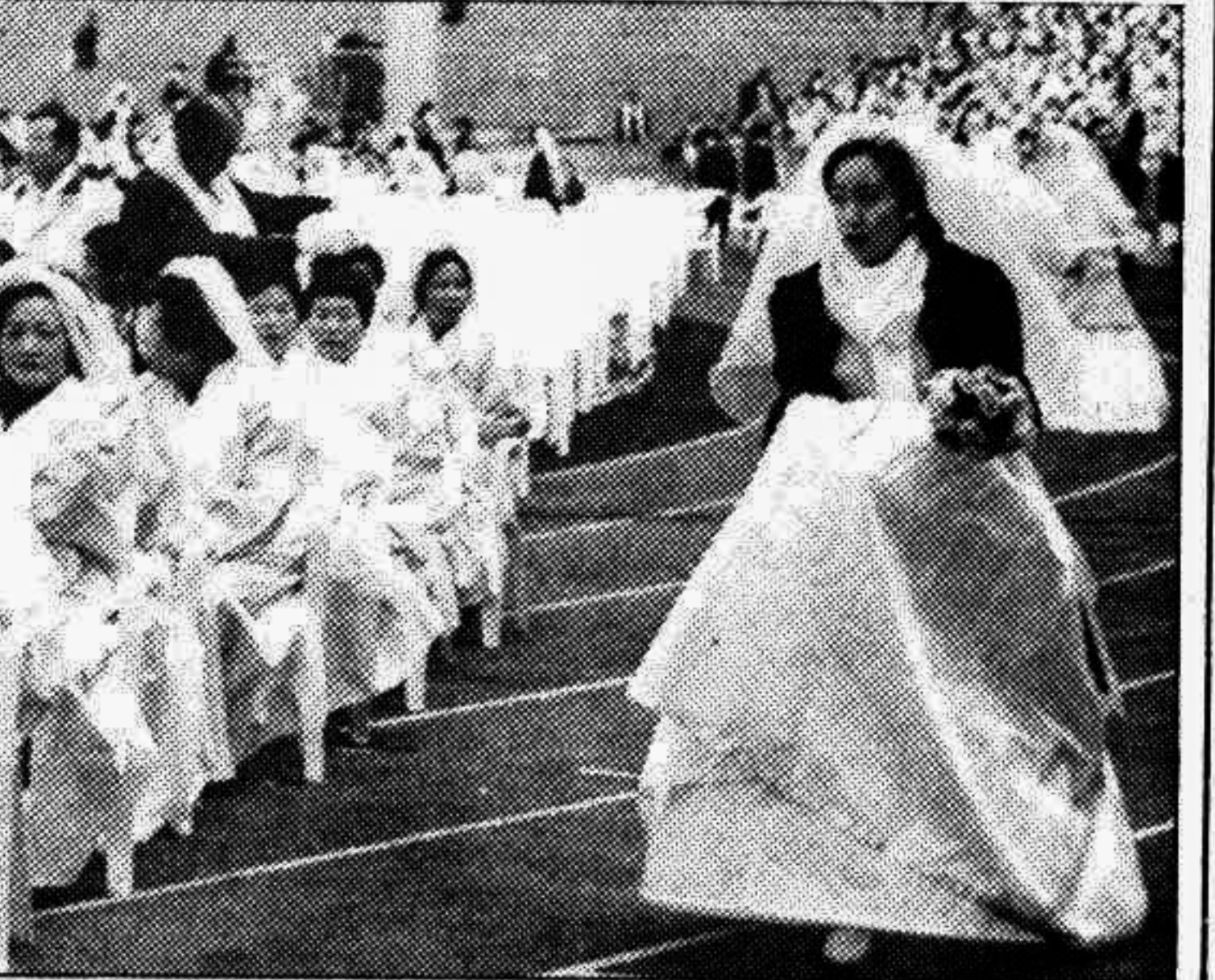
A young bride (R) from the Unification Church, known as "Moonies", has a look at the older brides (L) as she walks past them at Seoul's Olympic Stadium where Unification Church founder Sun Myung Moon officiated over the weddings of some 40,000 couples of his believers yesterday.