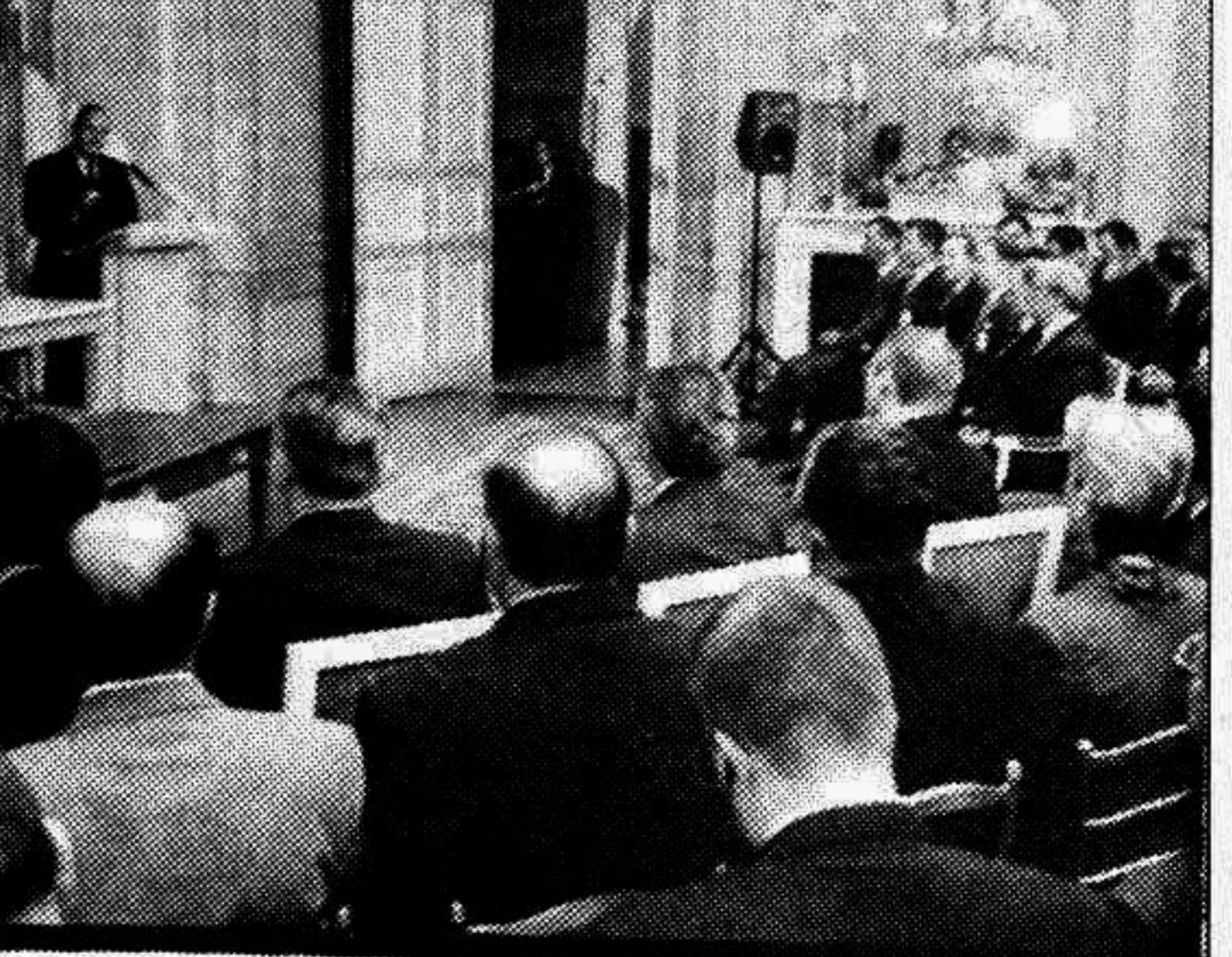
Delegations representing the Serbs and ethnic Albanians from Kosovo listen to French President Jacques Chirac at the opening of the Kosovo peace talks at the Rambouillet Chateau near Paris Saturday.