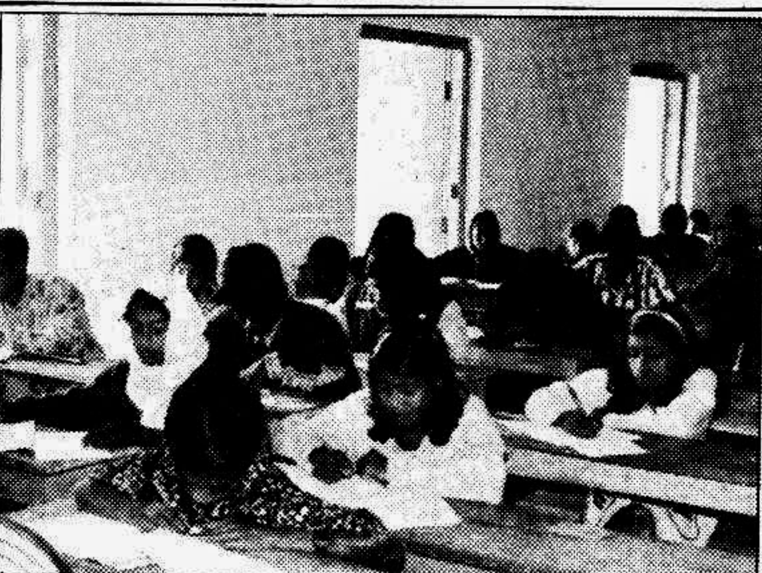
JHENIDAH: Primary scholarship examination was held recently here peacefully. The picture was taken from an examination centre at Sailkupa Degree College.