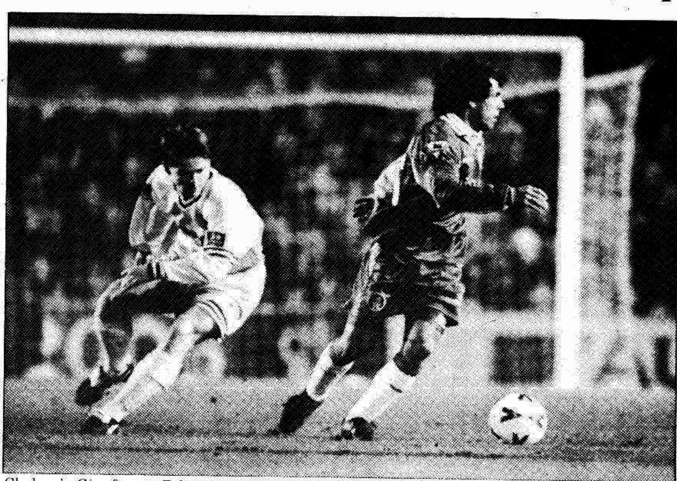
Chelsea's Gianfranco Zola (R) shuns an unidentified Oxford United player during their FA Cup third round replay at Stamford Bridge in London on February 3.