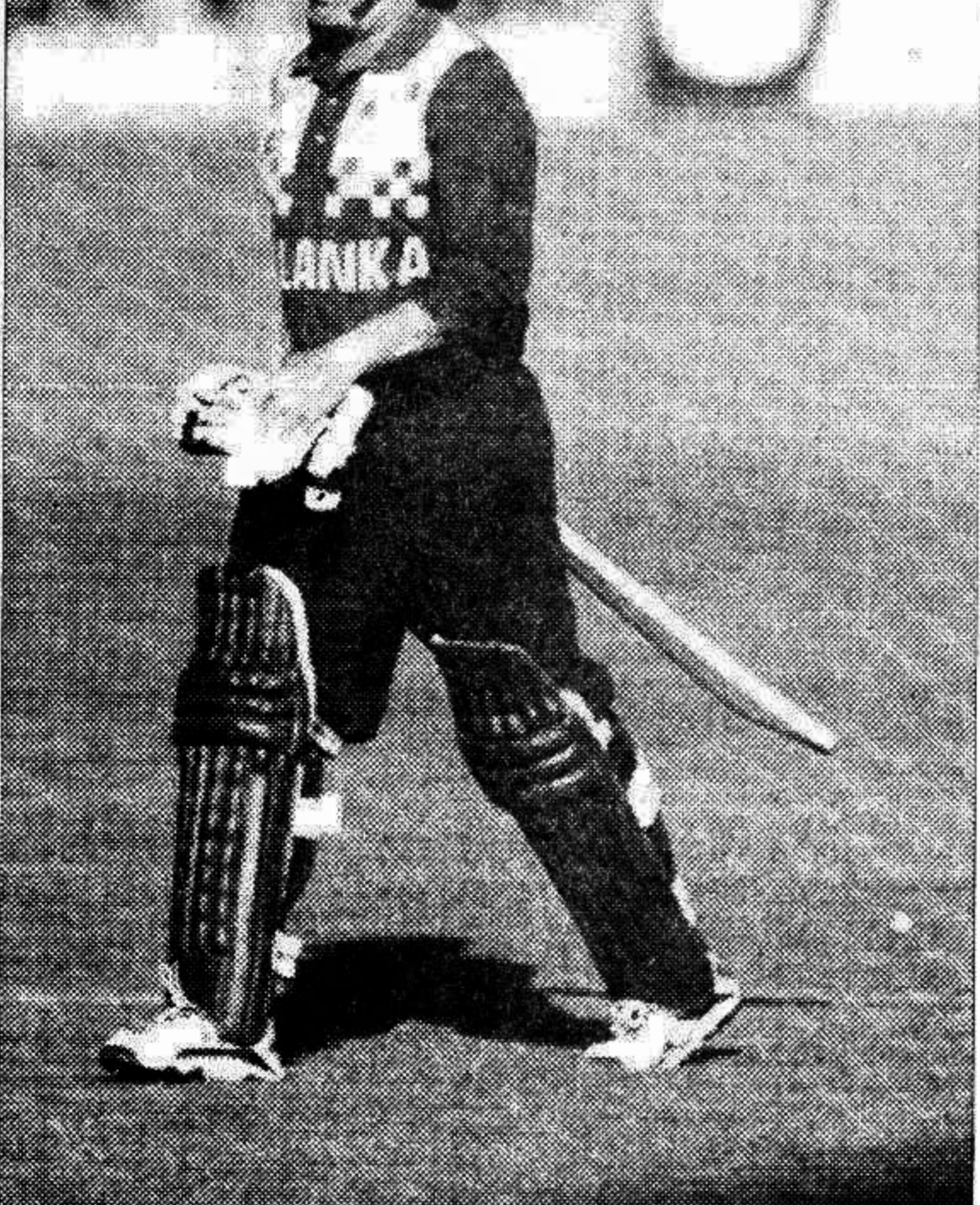
Arjuna Ranatunga leaves the ground after being dismissed at Sydney yesterday.