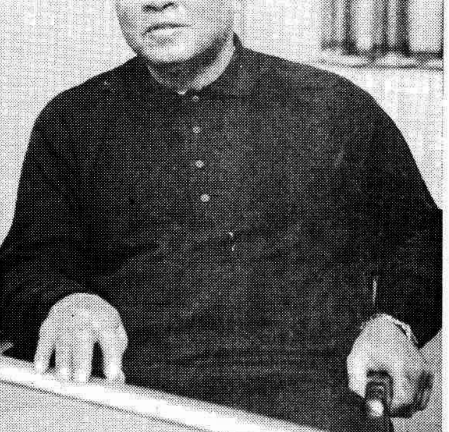
Boxing legend Muhammad Ali talks to newsmen at New York on February 2 regarding the planned Muhammad Ali Centre which is scheduled to be inaugurated at Ali's hometown in Louisville, Kentucky on February 17.

It was bitterly contested by Wimbledon who thought Les Ferdinand committed a foul in setting up the goal, a simple tap, for Allan Nielsen but referee Dermot Gallagher rejected their arguments.