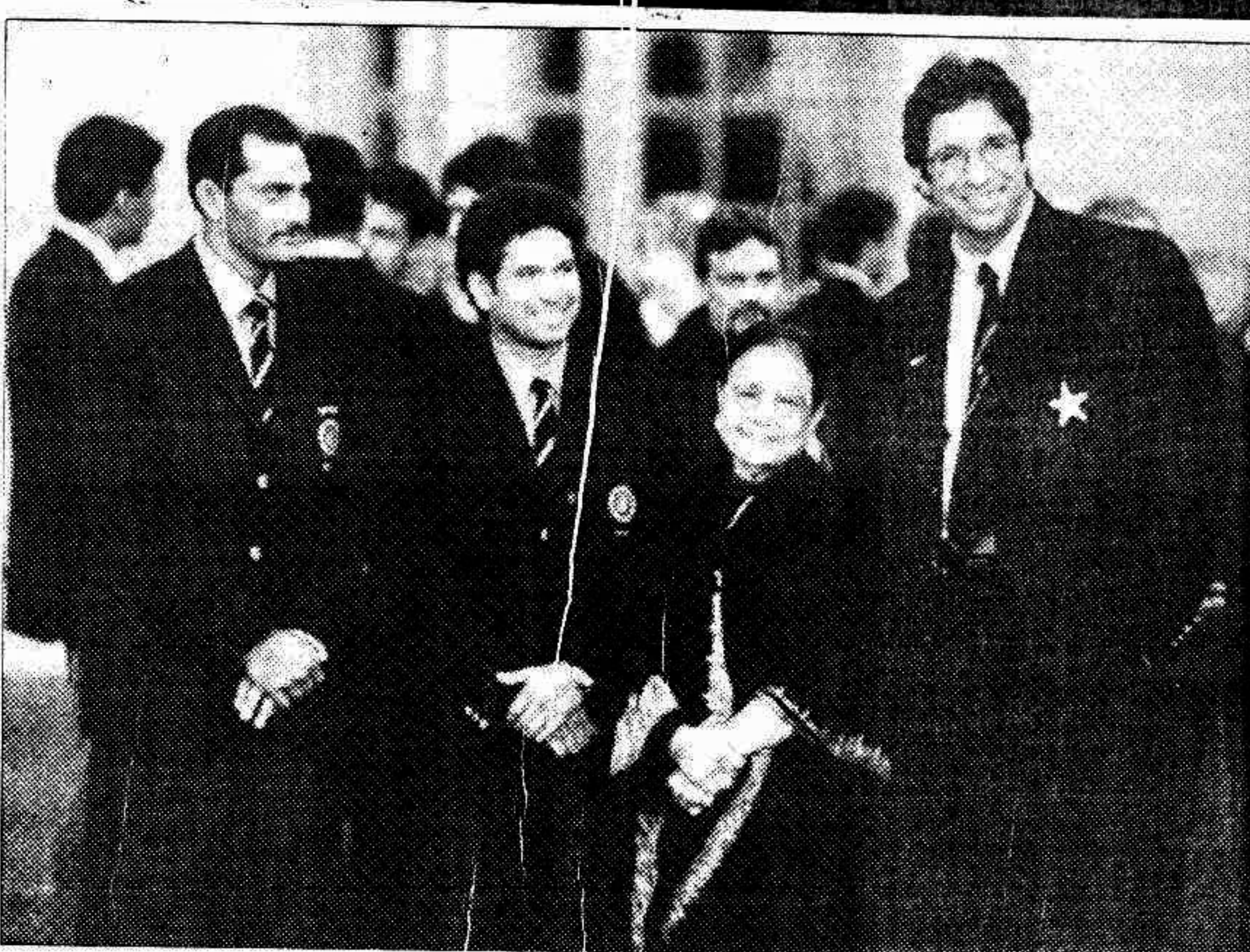
Usha Narayanan (2nd from R), wife of Indian President K R Narayanan, is flanked by Pakistan skipper Wasim Akram, his Indian counterpart Mohammad Azharuddin and star batsman Sachin Tendulkar during a presidential reception at New Delhi on February 2.