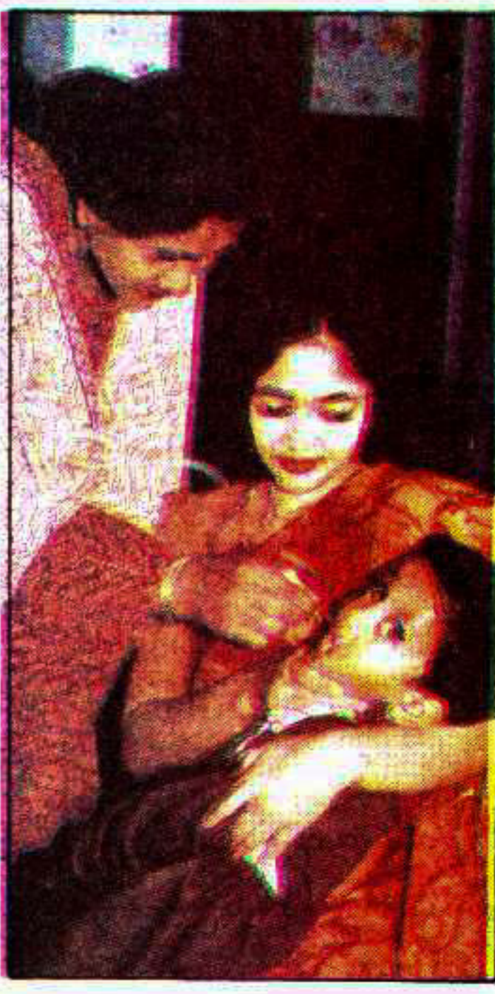
A health worker administers polio vaccine to a child in the city on the second phase of the 5th National Immunisation Day yesterday.

Investors as well. The prime minister said: 'While we seek investment from developed nations, we should ensure that surplus funds from member states of SAARC should flow into other member countries.'