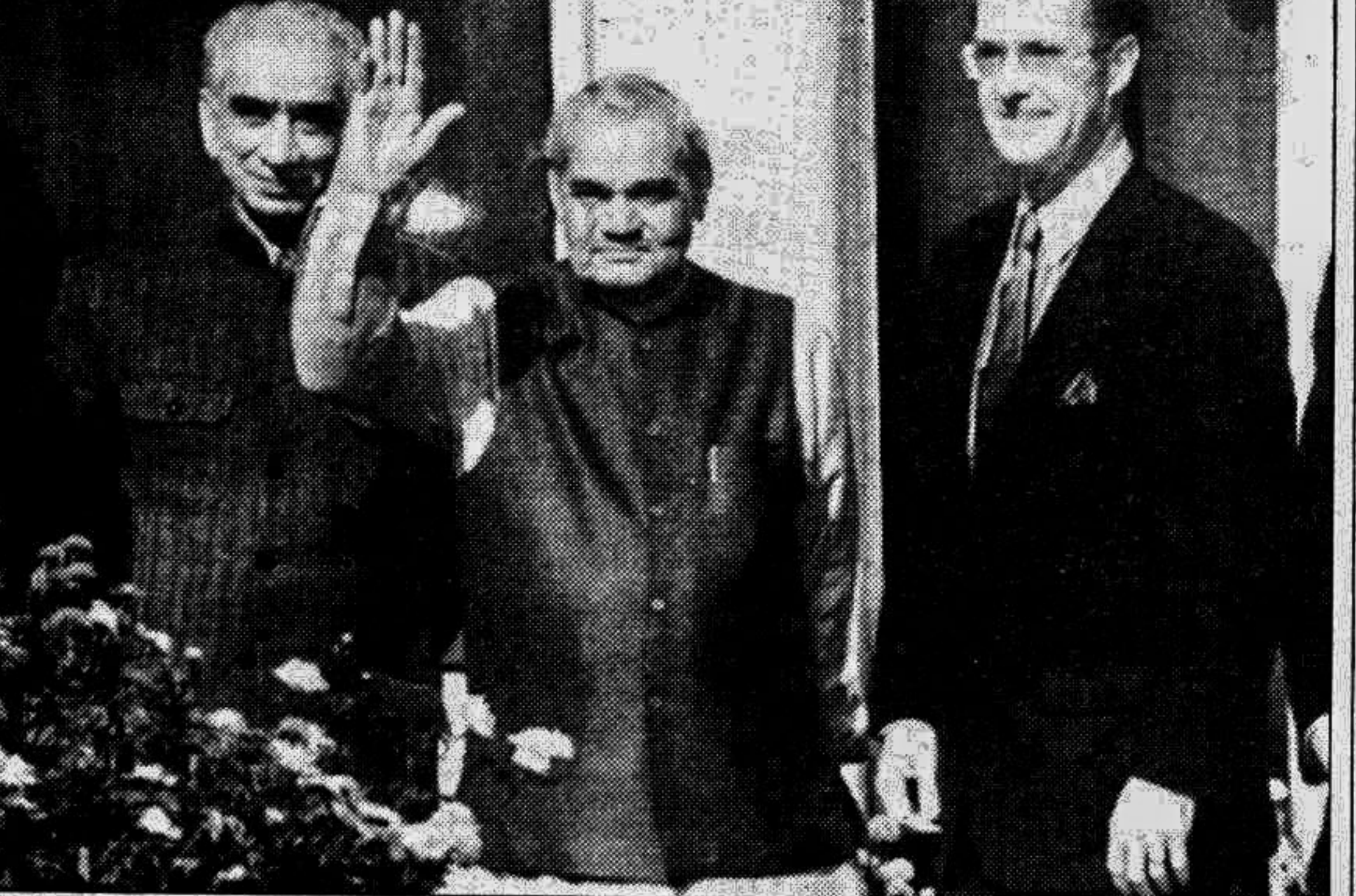
Indian Foreign Minister Jaswant Singh, left, Prime Minister Atal Behari Vajpayee, and US Deputy Secretary of State Strobe Talbot greet members of the press yesterday in New Delhi. India will sign the Comprehensive Test Ban Treaty in exchange for the unfreezing of international lending, senior US and Indian officials said yesterday. (Story on page-9).

The reports contained note of dissents from Alamgir Kabir and Moshir Rahman, both from BNP. The BNP members suggested to specify the number of pro-vice chancellors for the universities instead of the words 'more than one.'