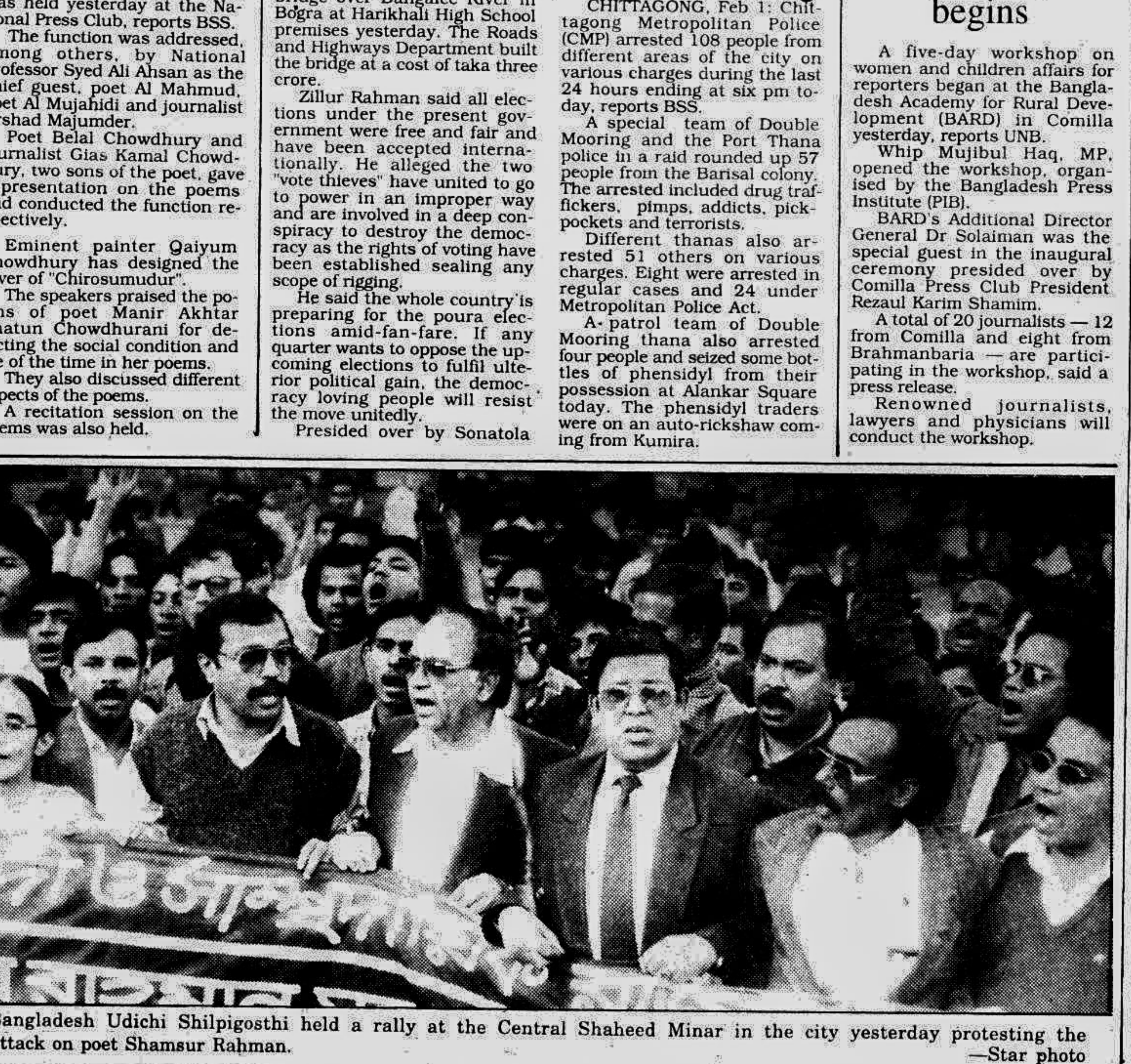
Bangladesh Udichi Shilpigosthi held a rally at the Central Shaheed Minar in the city yesterday protesting the attack on poet Shamsur Rahman.

108 arrested in Ctg CHITTAGONG, Feb 1: Chittagong Metropolitan Police (CMP) arrested 108 people from different areas of the city on various charges during the last 24 hours ending at six pm today, reports BSS. A special team of Double Mooring and the Port Thana police in a raid rounded up 57 people from the Barisal colony. The arrested included drug traffickers, pimps, addicts, pickpockets and terrorists. Different thanas also arrested 51 others on various charges. Eight were arrested in regular cases and 24 under Metropolitan Police Act. A patrol team of Double Mooring thana also arrested four people and seized some bottles of phensidyl from their possession at Alankar Square today. The phensidyl traders were on an auto-rickshaw coming from Kumira.