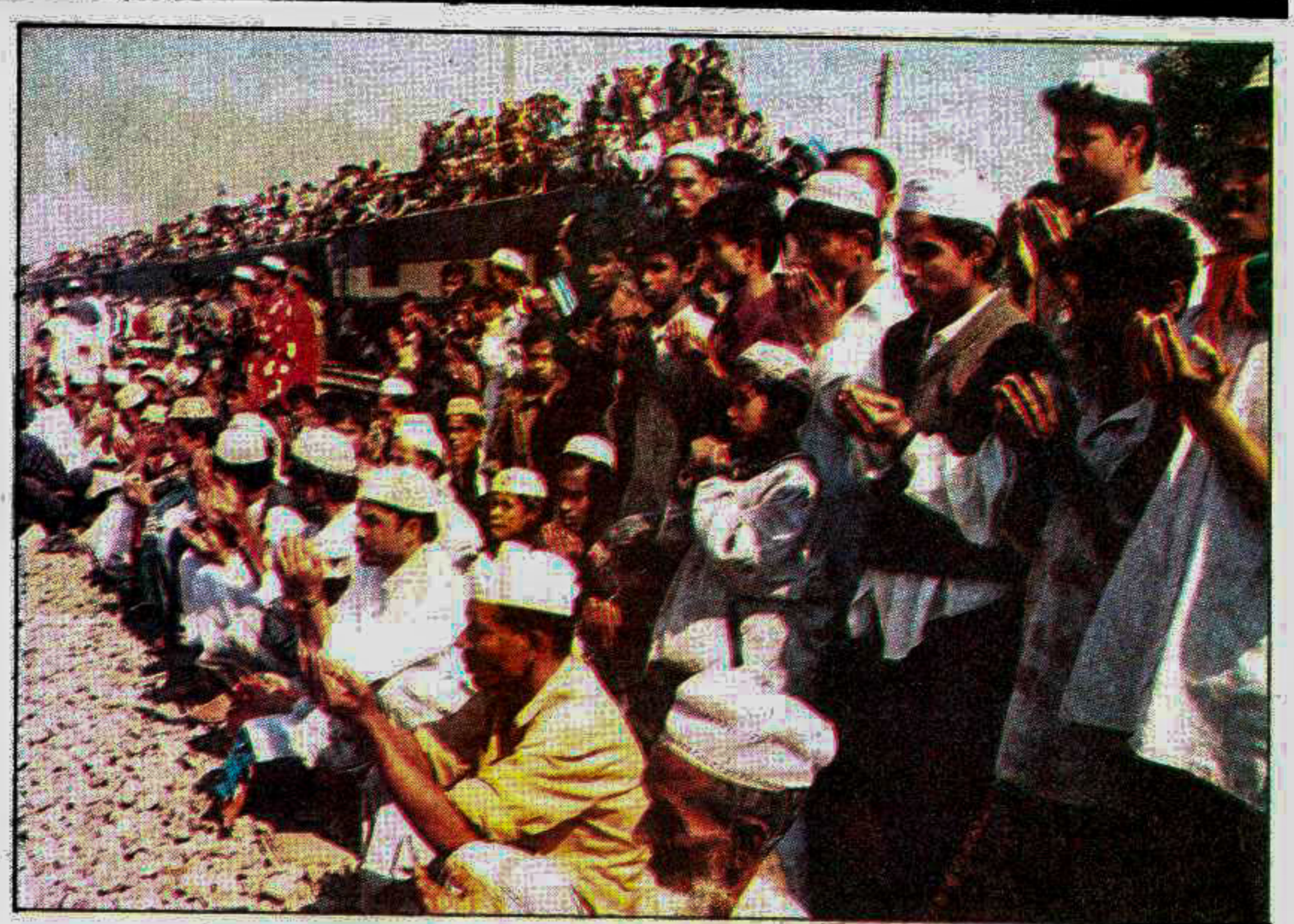
Devotees in their thousands on board the train and outside join the Akheri Munajat on the concluding day of the three-day Biswa Ijtema at Tongi yesterday.

By Staff Correspondent Education Minister ASHK Sadique yesterday said at the Jatiya Sangsad that the government had no plan to ban madrassah education in the country. "This government is taking no action against madrassah teachers and students. If found linked with any terrorist activities, the accused will be nabbed irrespective of their student or non-student identities", the minister said while giving a statement in Parliament. Allaying misunderstanding among certain quarters, the minister said, "There is no point in banning madrassah education. Rather, the government has already taken various projects for development of religious education". Sadique regretted that certain quarters were spreading untrue and motivated statements even in mosques during Juma prayers. "Just because persons with arms in posses-