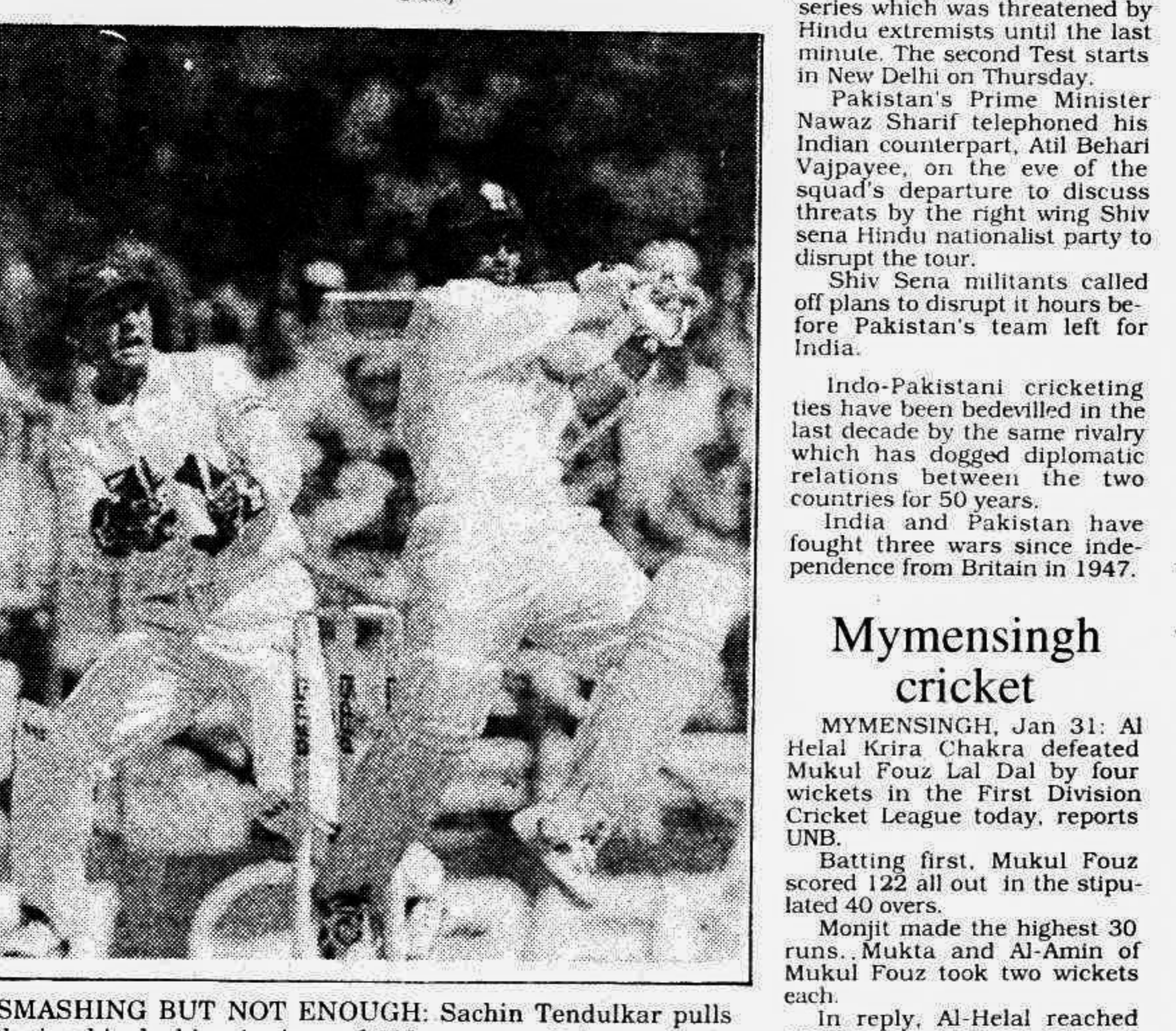
SMASHING BUT NOT ENOUGH: Sachin Tendulkar pulls during his dashing innings of 136.

"We want to win here too, because it has been a long time playing against India," he said