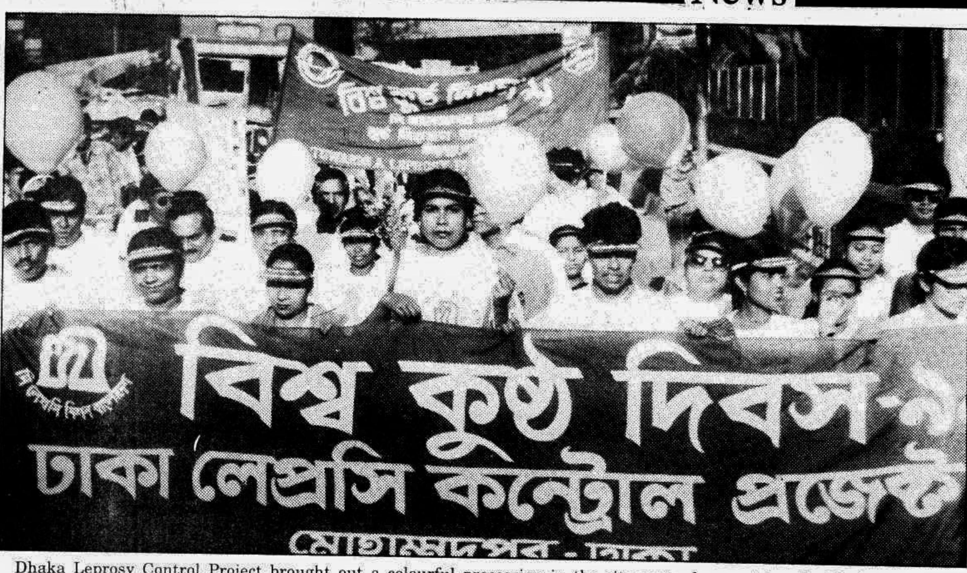
Dhaka Leprosy Control Project brought out a colourful procession in the city yesterday marking the World Leprosy Day.

Deans, head of departments, teachers and other university officials were also present.