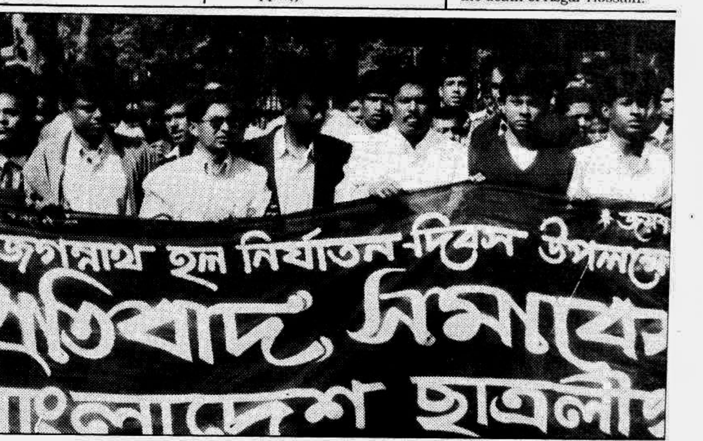
BCL brought out a procession on the Dhaka University campus yesterday to mark the 'Jagannath Hall Repression Day'.

In a ground attack near the eastern town of Vakkara, army soldiers ambushed a group of Tiger guerrillas and recovered the bodies of nine, the defence ministry statement said.