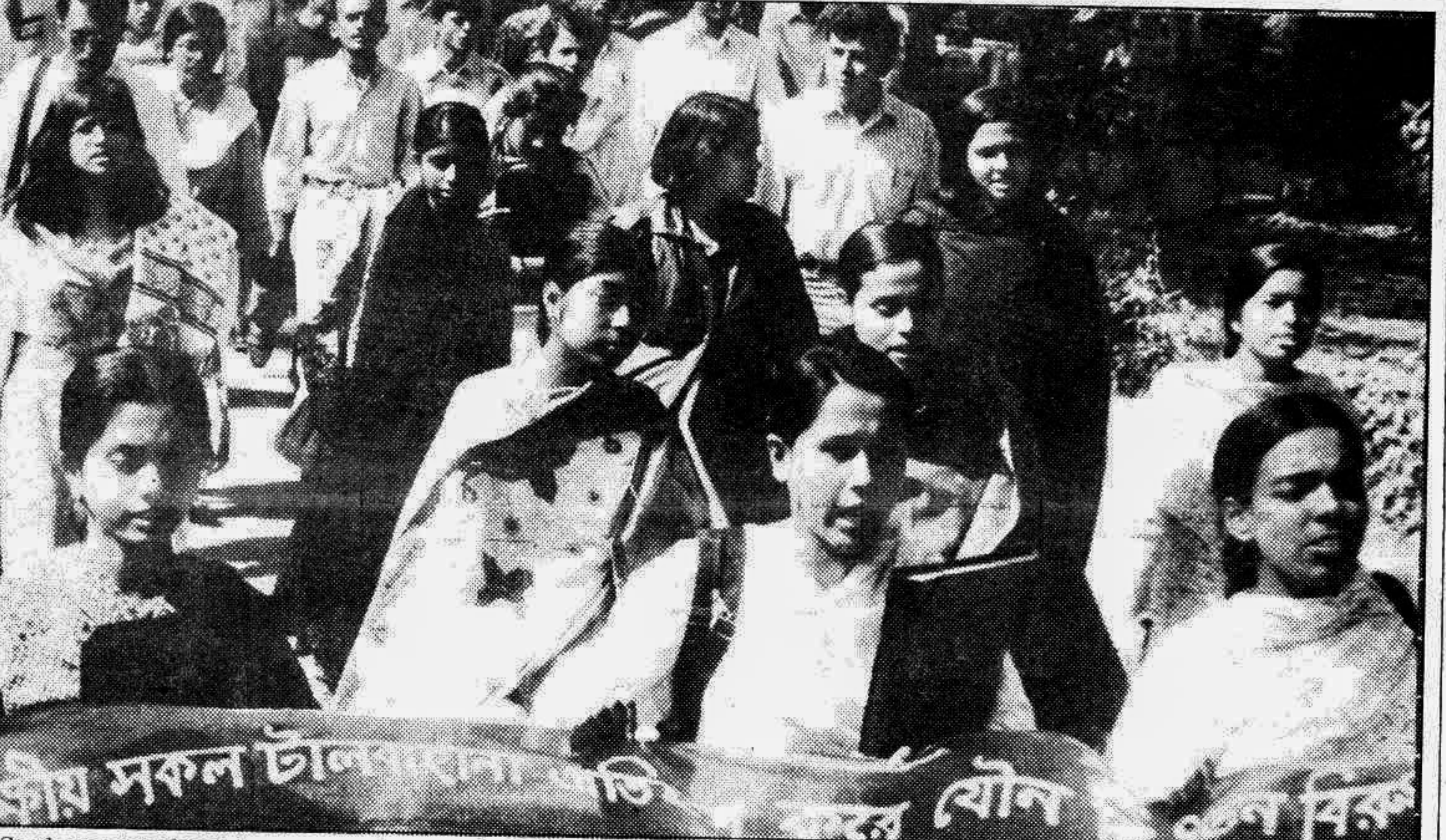
Students marching in a procession on the Dhaka University campus yesterday demanding introduction of a 'code of conduct' to check incidents of sexual harassment.