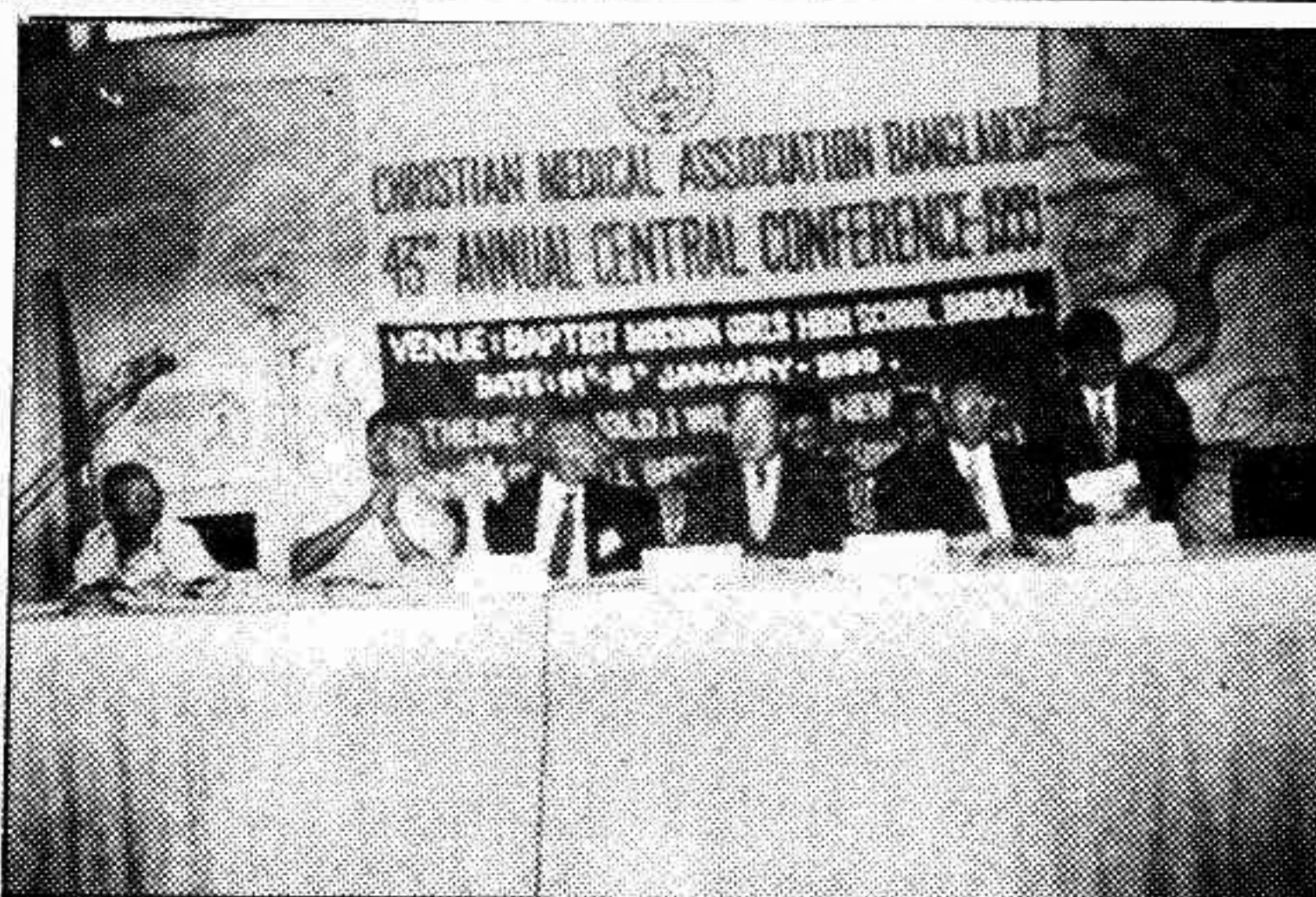
BARISAL: The 43rd annual conference '99 of Christians Medical Association of Bangladesh (CMAB) was held here recently.