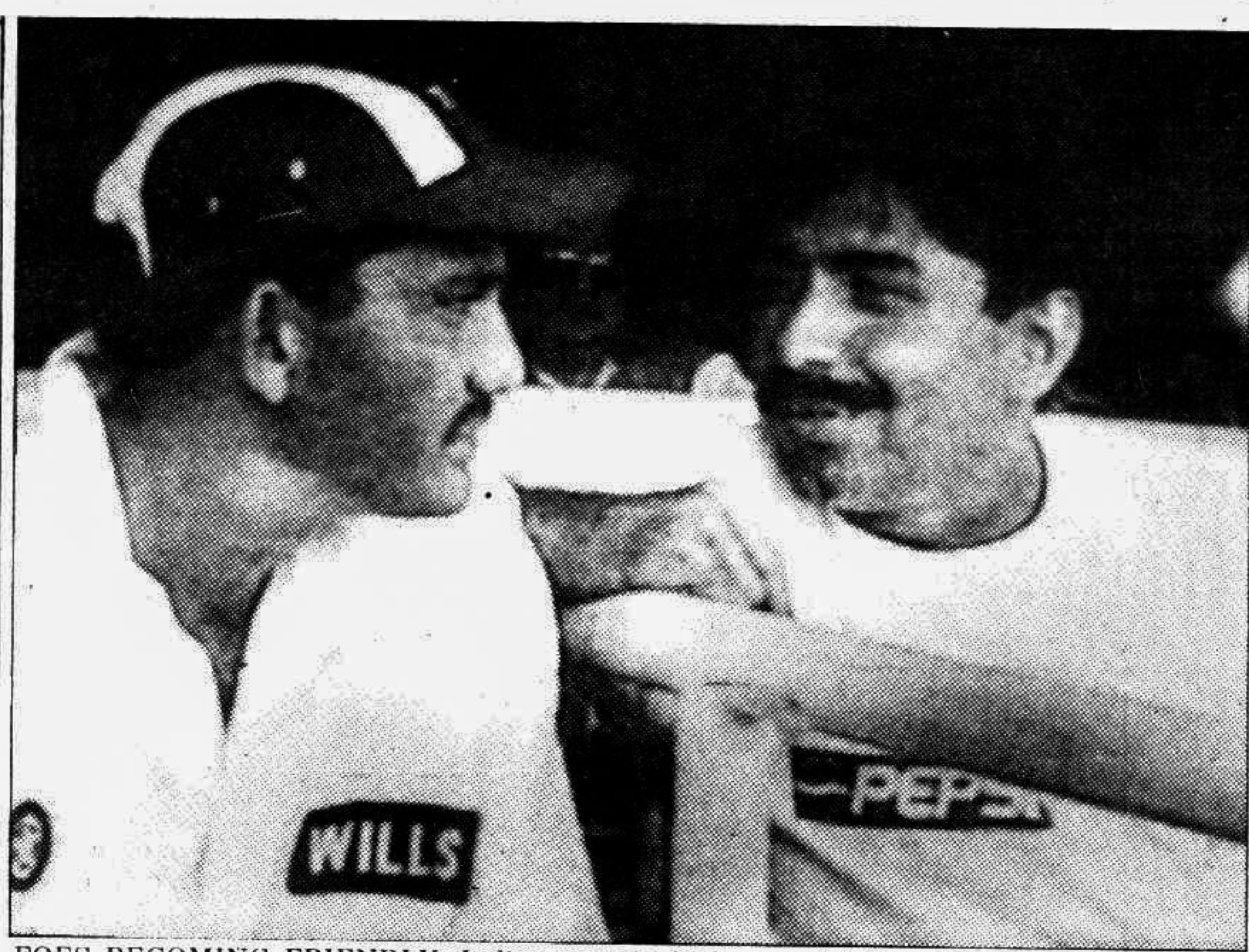
FOES BECOMING FRIENDLY: Indian captain Mohammad Azharuddin (L) and Pakistan coach Javed Miandad having a chat during the second day's play at the Chepauk Stadium yesterday.

"I am going to give my bonus (for reaching the finals) to the victims. I hope that my teammates will do the same," he said.