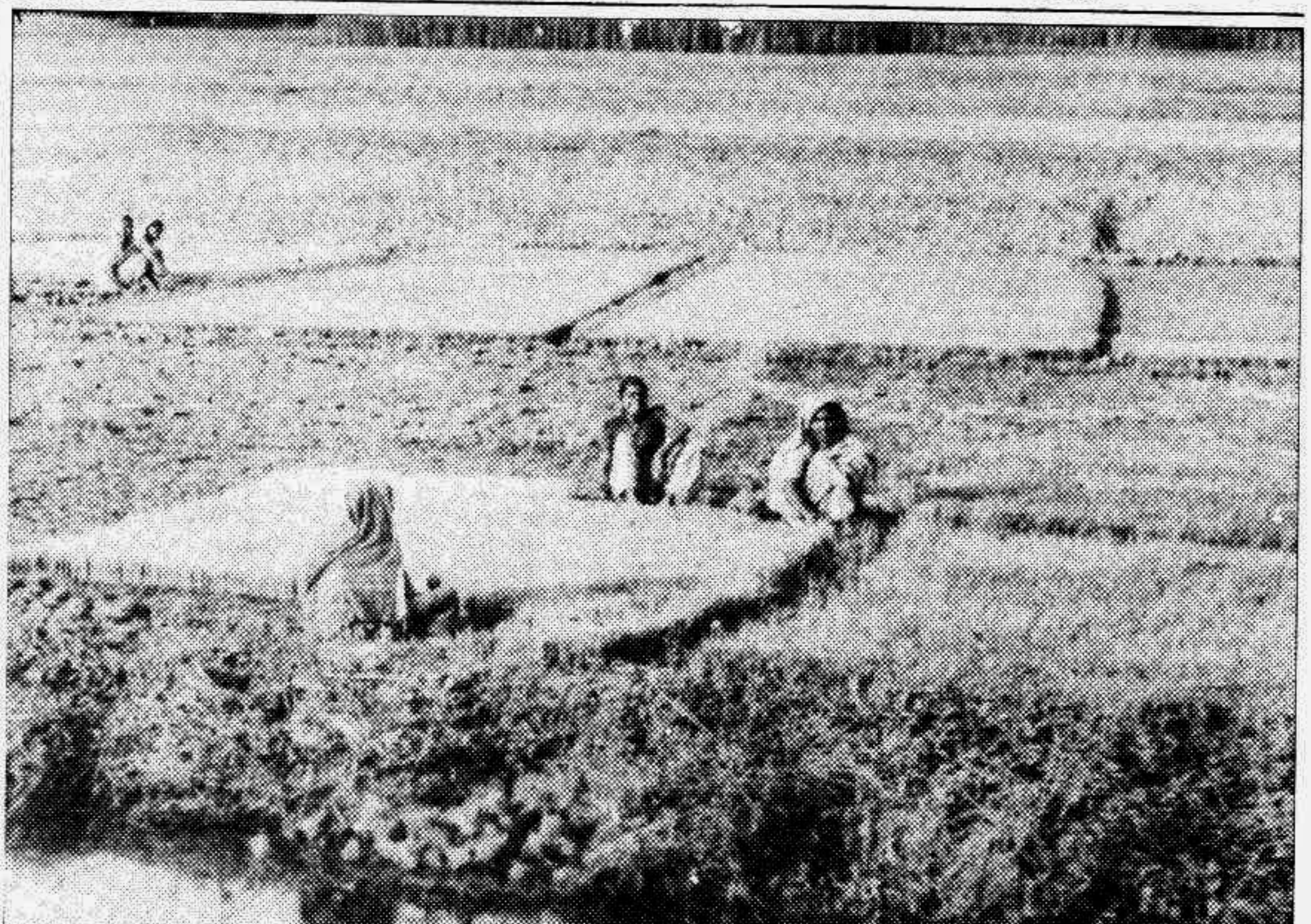
NATORE: Some women collecting seedlings from seedbeds recently in Borovita village in the sadar thana.

He said Travelling Ticket Examinees (TTE) were found unwilling to be serious in performing their duties in fear of harassment by the ticketless passengers. Allegations are also there that ticket counters in railway stations are opened just before the arrival of trains, forcing many a passengers to travel without tickets.