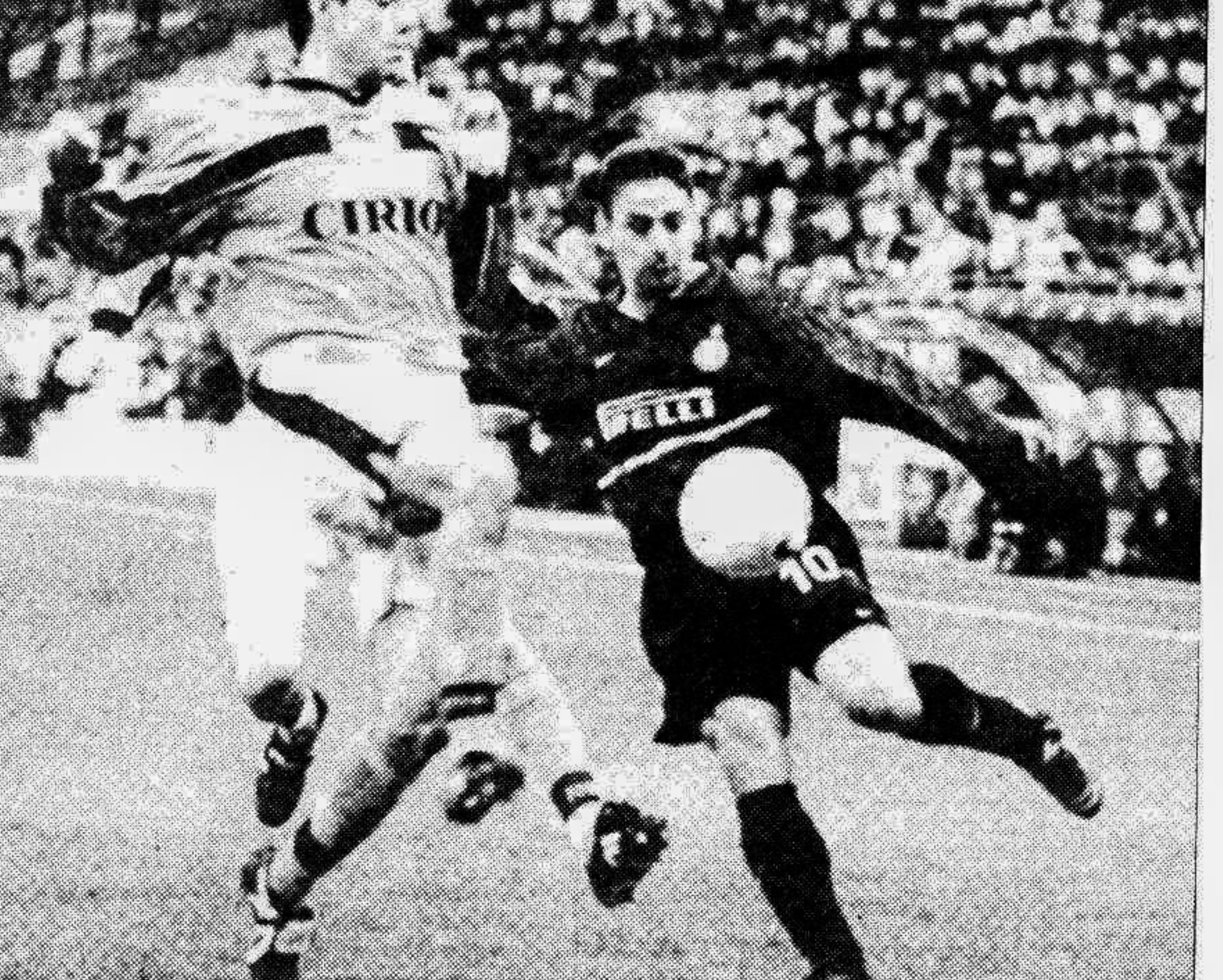
Lazio defender Alessandro Nesta (L) makes an attempt to stop Inter Milan striker Roberto Baggio from taking a shot during their Italian Cup second-leg quarterfinal match in Milan on January 27.

A nagging knee injury has limited his play and effectiveness for Inter this season.