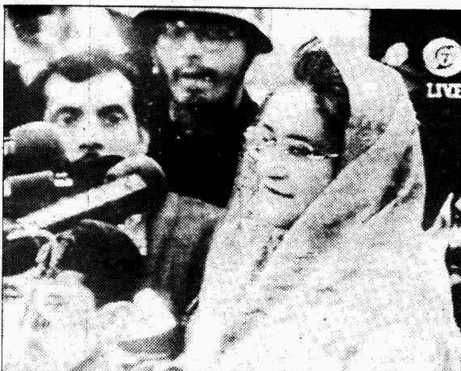
Prime Minister Sheikh Hasina addresses as chief guest the opening ceremony of the Calcutta Book Fair '99 in the West Bengal capital yesterday.