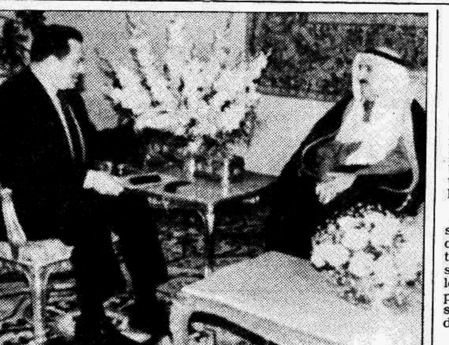
Kuwaiti Foreign Minister, Sheik Sabah al-Ahmed al-Sabah (Right) meets with Egyptian President Hosni Mubarak, Monday, the day after Arab League foreign ministers met in Cairo to discuss the Iraqi crisis.

Rosvooruzheniye, Russia's state-owned arms exporter, does not expect to make more than 2 billion dollars in arms sales abroad in 1999, similar to levels it reached last year, company director Grigory Raporta said in an interview with the daily Kommersant newspaper.