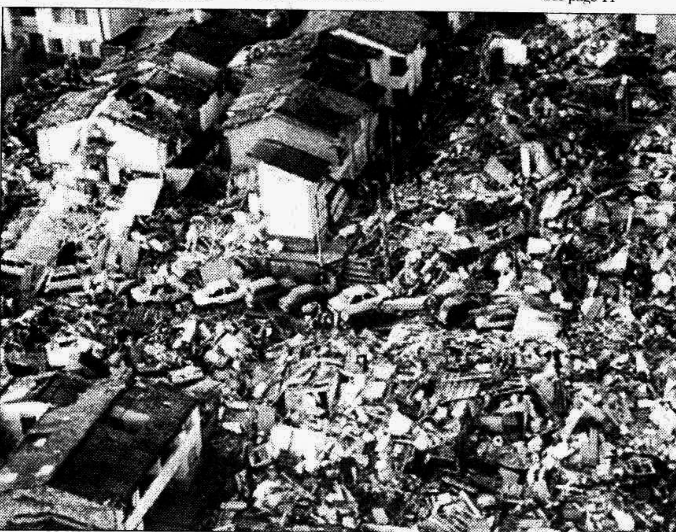
A residential neighbourhood in Armenia, 110 miles, west of the capital of Colombia, Bogota, after an earthquake, which had a preliminary magnitude of 6, tore up western Colombia on Monday, killing over 1000 people.