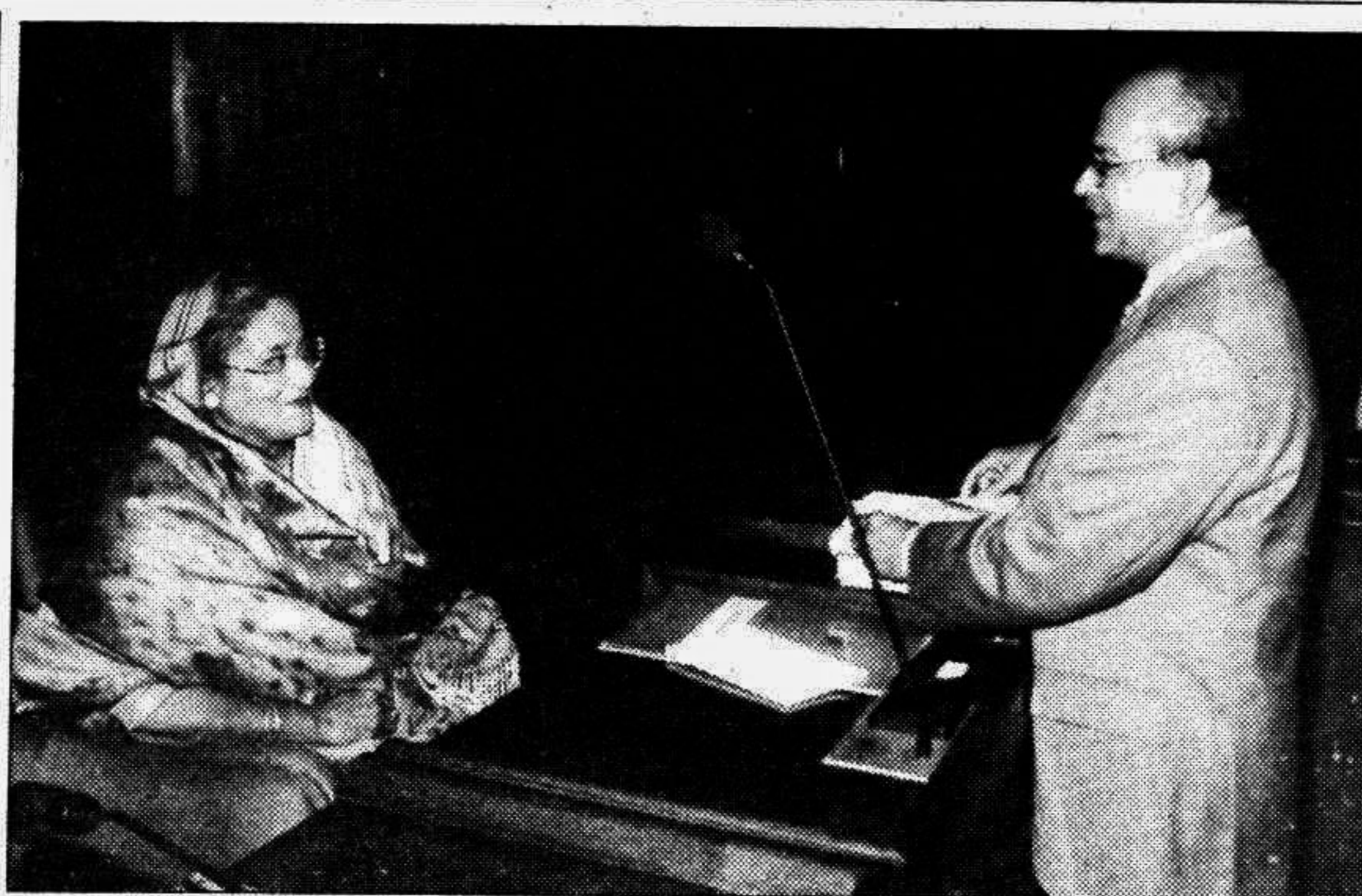
Well done, my boy ... My pleasure, madam

Bangladesh's major buyers are Italy, Brazil, Germany, France, Japan, Russia, China, USA, Hong Kong, Taiwan, Singapore, the Netherlands and Spain.