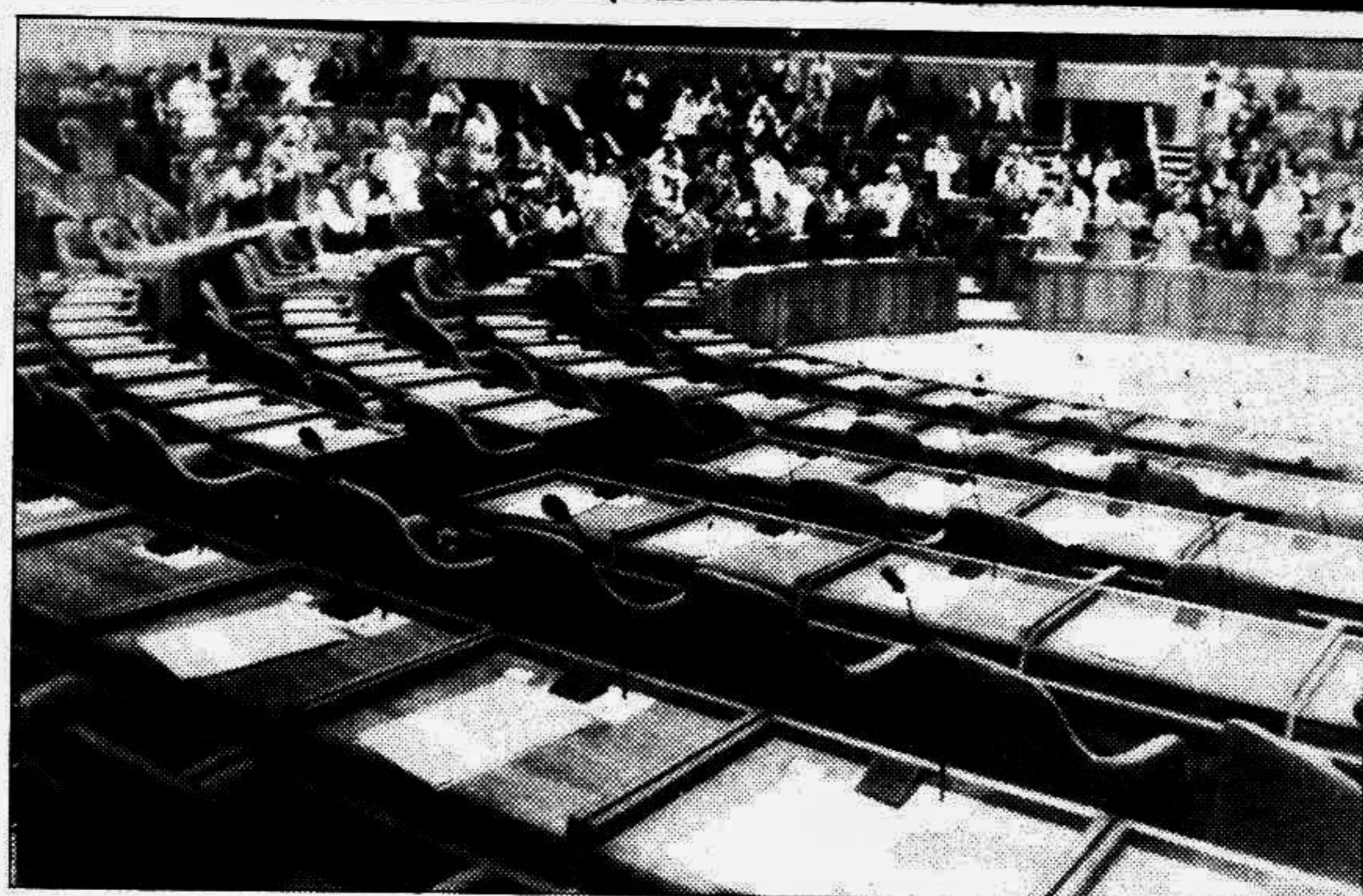
All quiet on the opposition front

About the task for the future generation in the new century, See page 11