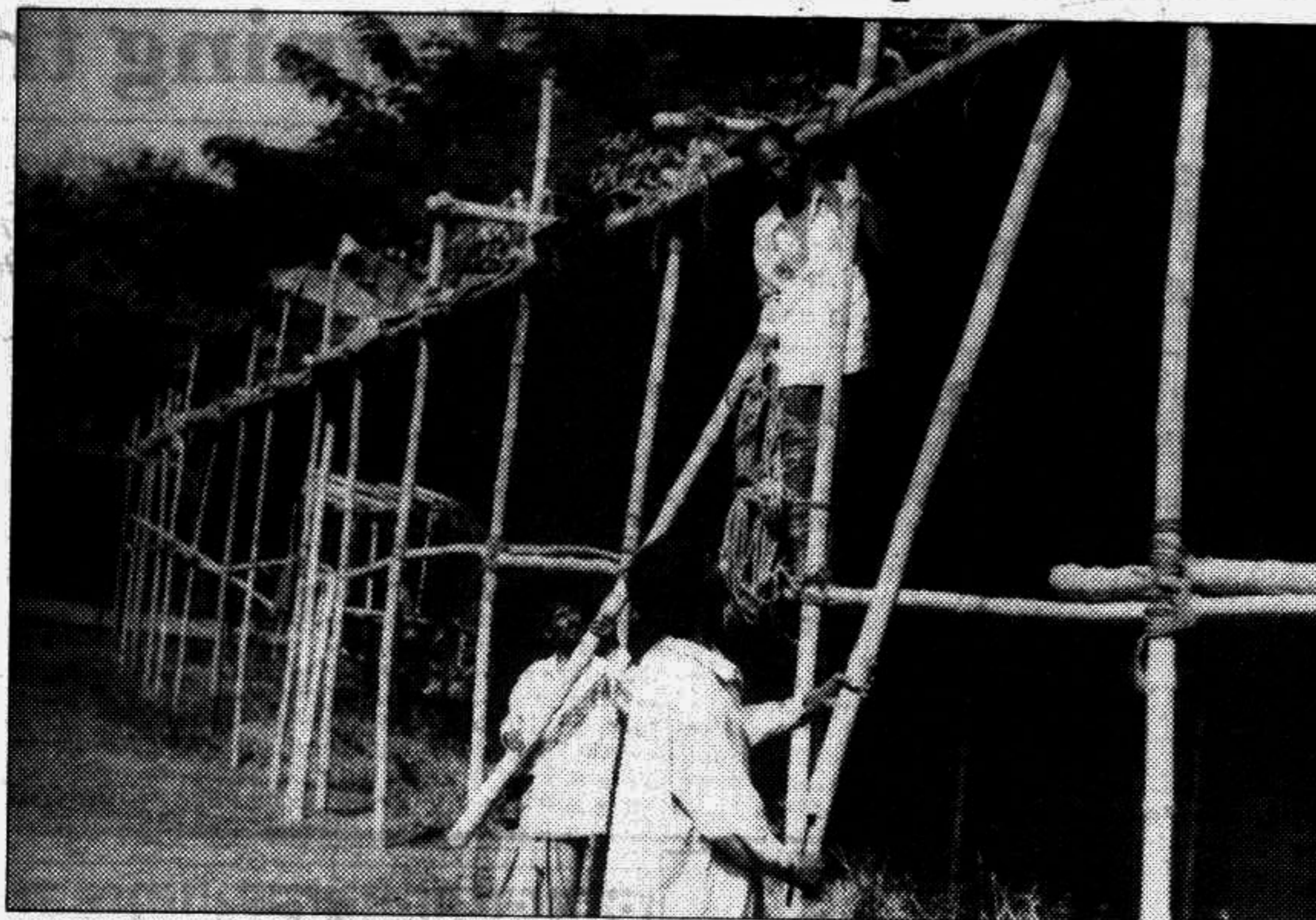
Preparations going on for holding the Ekushey Book Fair on the Bangla Academy premises in the city.