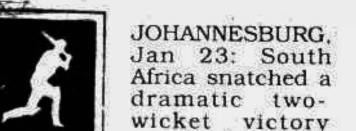
JOHANNESBURG, Jan 23: South Africa snatched a dramatic two-wicket victory over West Indies.

off the final ball of their rain-affected one-day match at the Wanderers on Friday, reports Reuters.