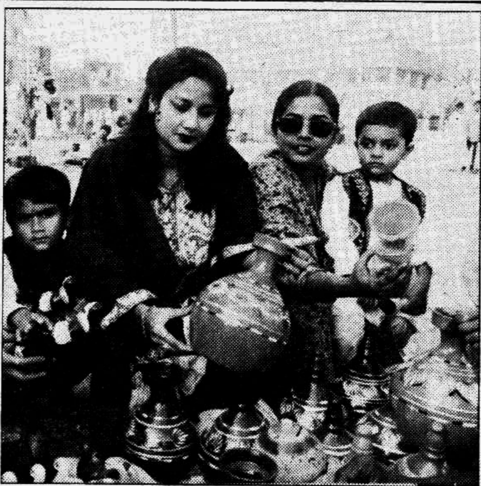
Visitors gather around a stall of artifacts at a fair being held at Hazaribagh in the city on the occasion of Eid-ul-Fitr.

Shahin went there at about 9 pm. But one Yusuf brought him home in a critical condition.