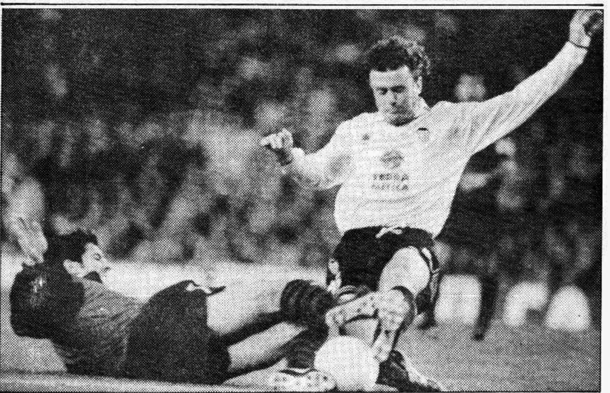
Barcelona's Luis Figo loses his balance while challenging Amadeo Carboni of Valencia (white jersey) during their Spanish Cup first round fixture at Nou Camp in Barcelona on February 18. Valencia won 3-2.

"But there's still a lot more to do: The attack has to create more scoring chances and convert them. Once we've strung together three or four consecutive results, then we can talk about a revival."