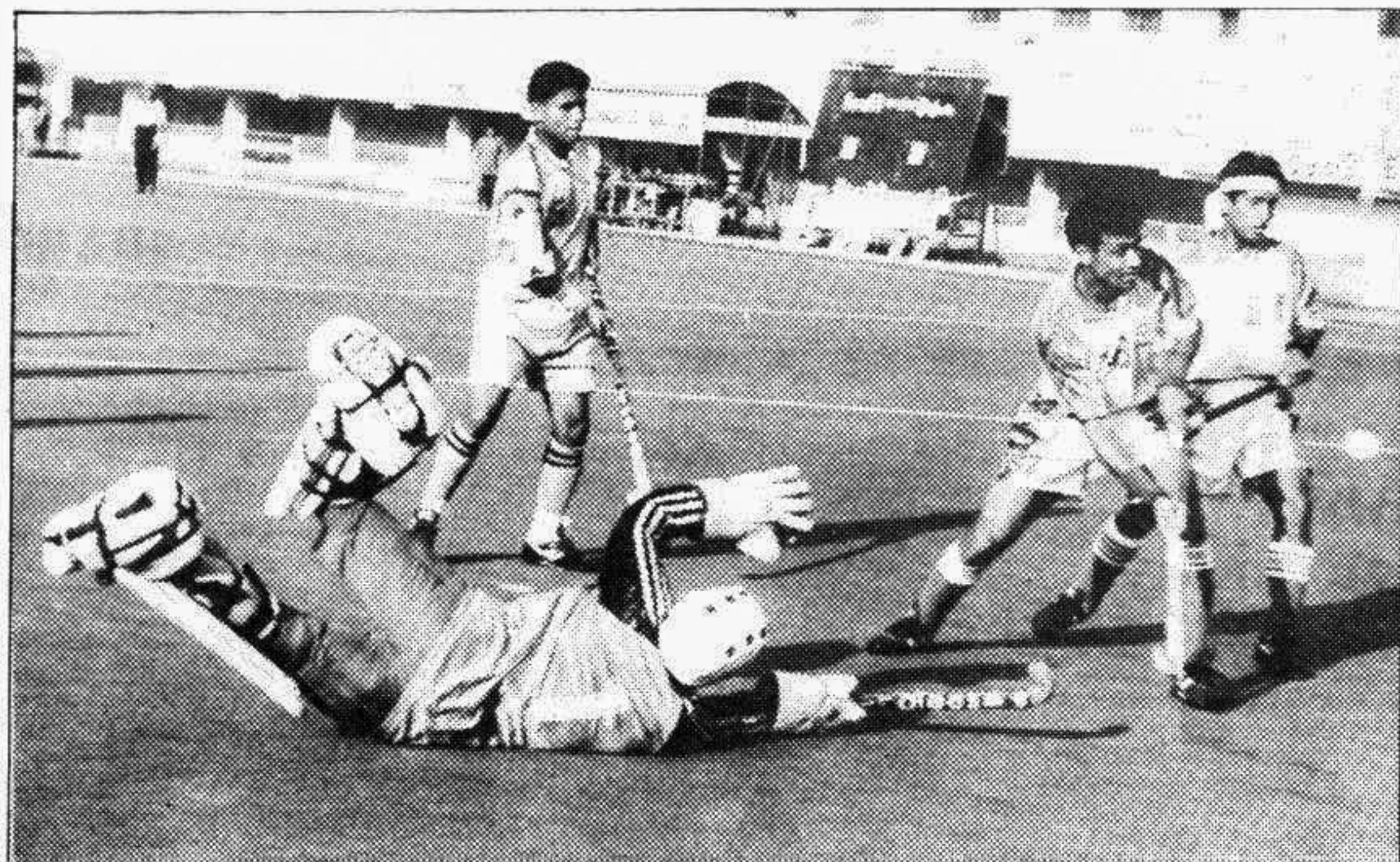
An Usha Krira Chakra attempt at the Bangladesh Airforce goal during the Cotton Group Shahid Smriti hockey tournament match at the Moulana Bhasani Stadium yesterday.

For this reason the squad of 14 will train together until Friday before it is trimmed to 13 for Saturday's crucial match.