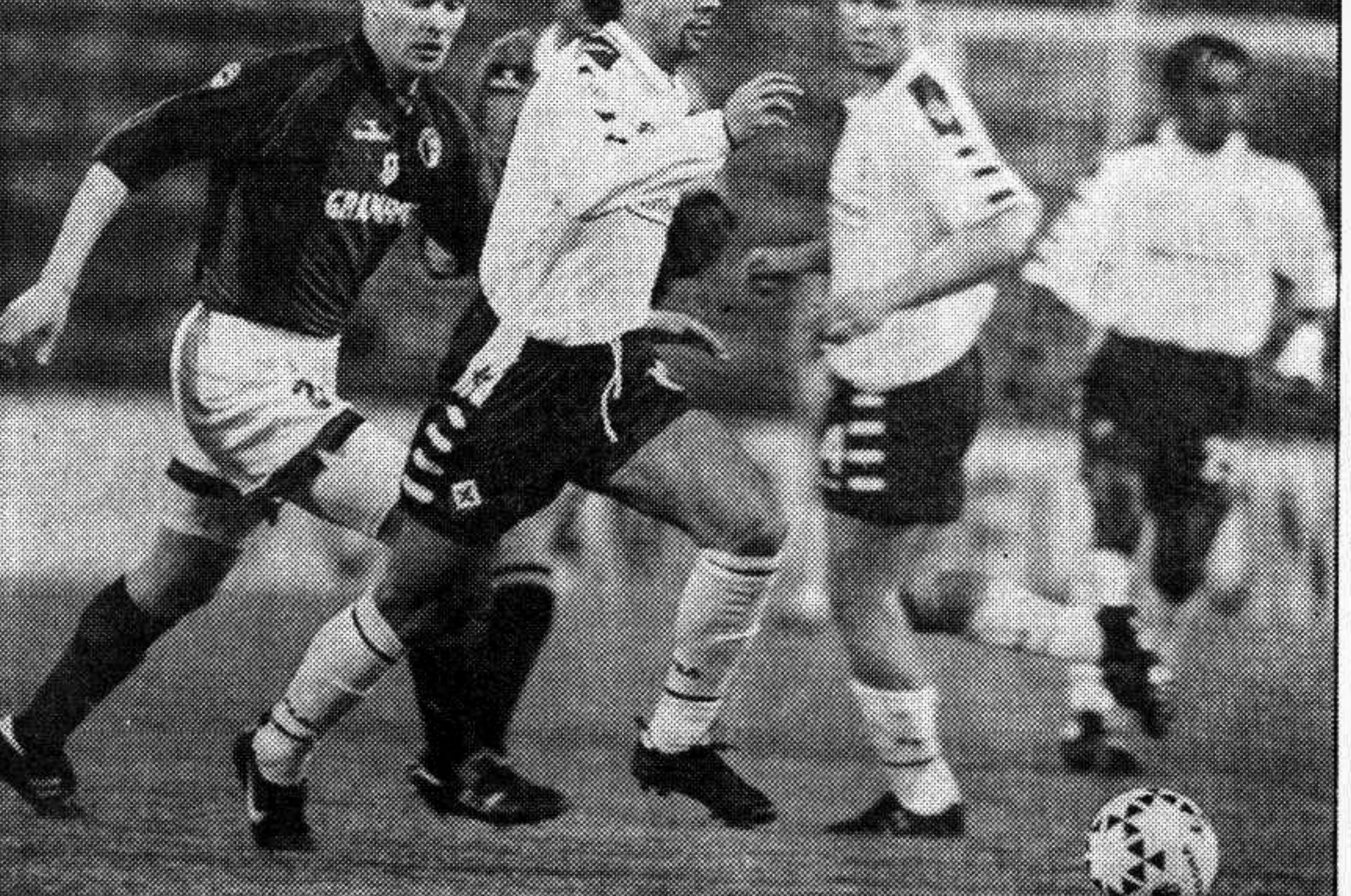
A scene from the Italian Cup clash between Fiorentina and Bologna in Bologna on February 18.

They have tried in vain 32 times since and with Jimmy Floyd Hasselbaink back on scoring form, it looks like the sequence will increase.