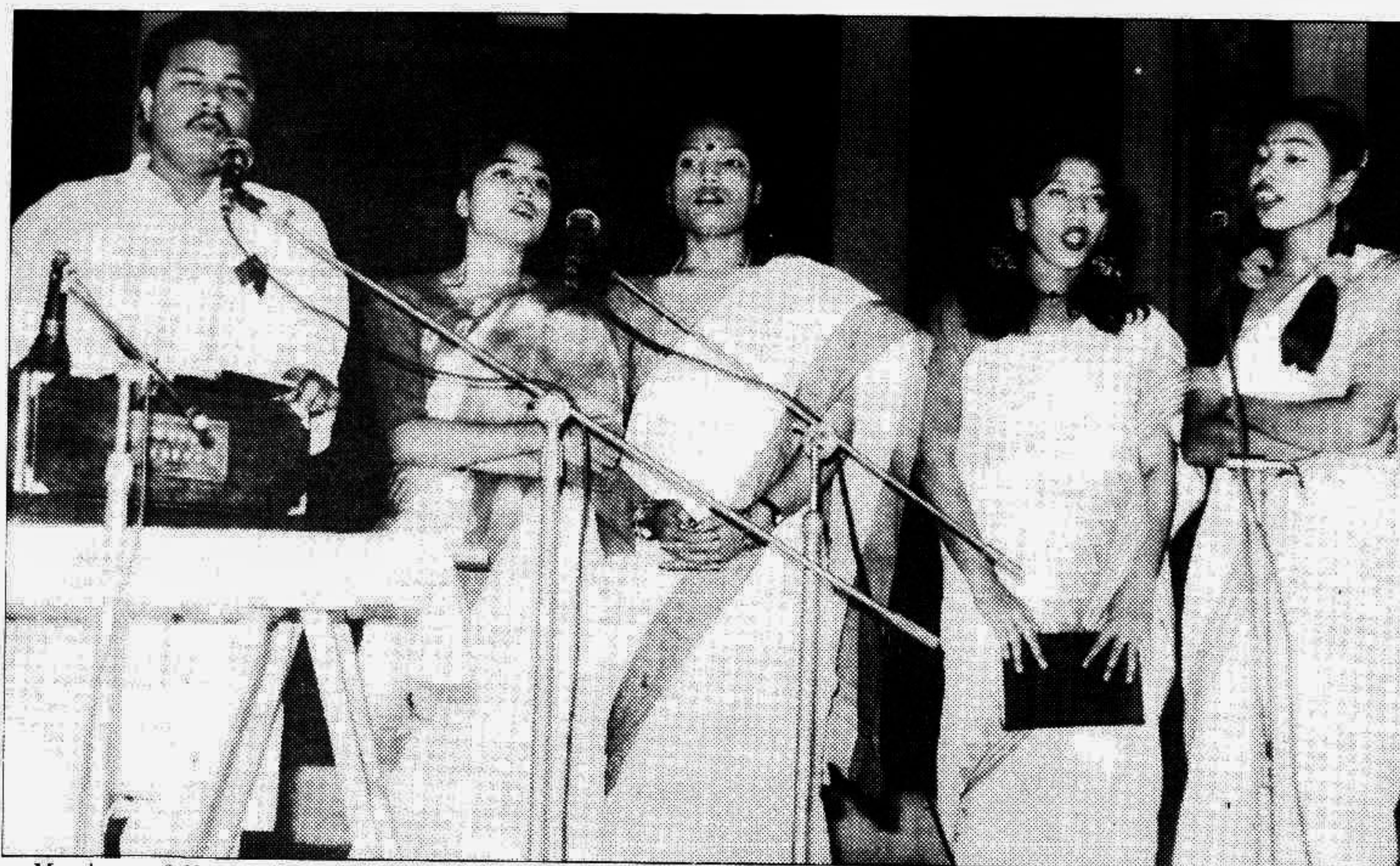
Members of Kranti Sangskritik Goshthi rendering songs at the Central Shaheed Minar yesterday as part of the Ekushey programme.