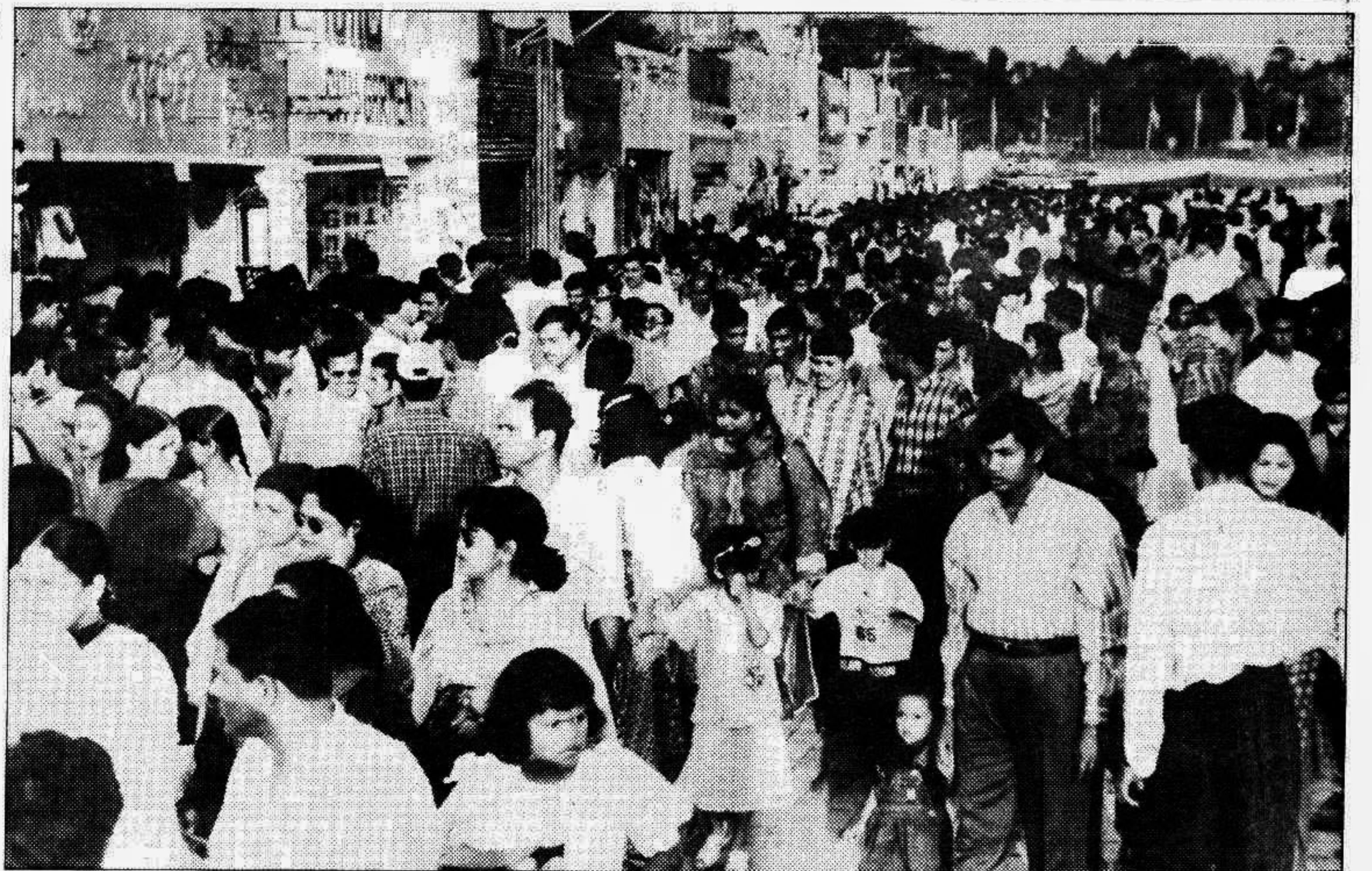
Visitors in thousands flock to the Dhaka International Trade Fair yesterday.