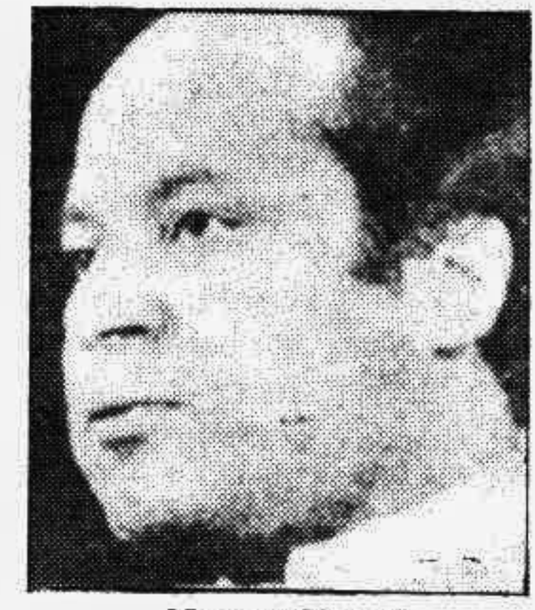
A B Vajpayee