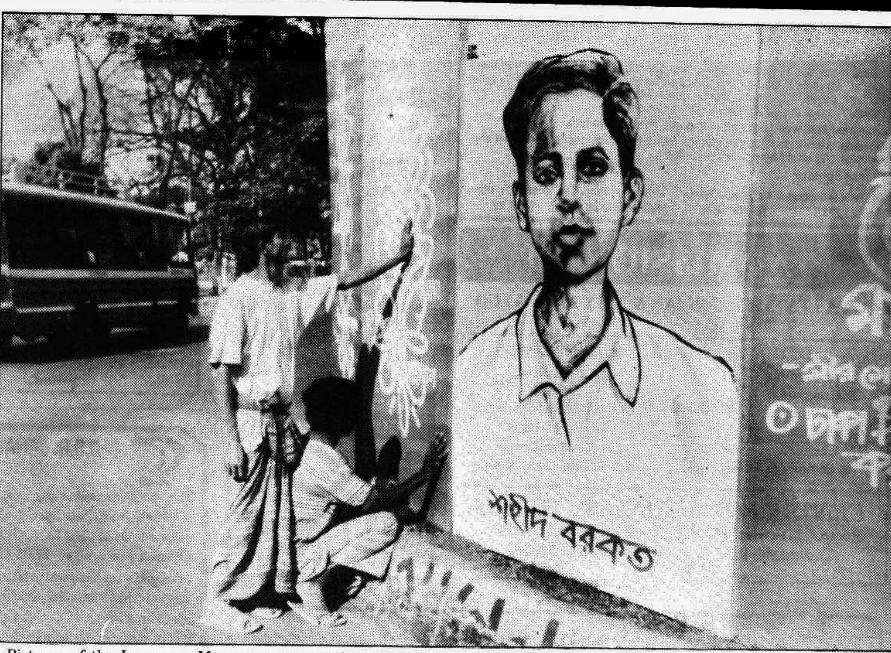
Pictures of the Language Movement martyrs being put on display at different points in the capital by the Dhaka City Corporation on the eve of the Amar Ekushey.