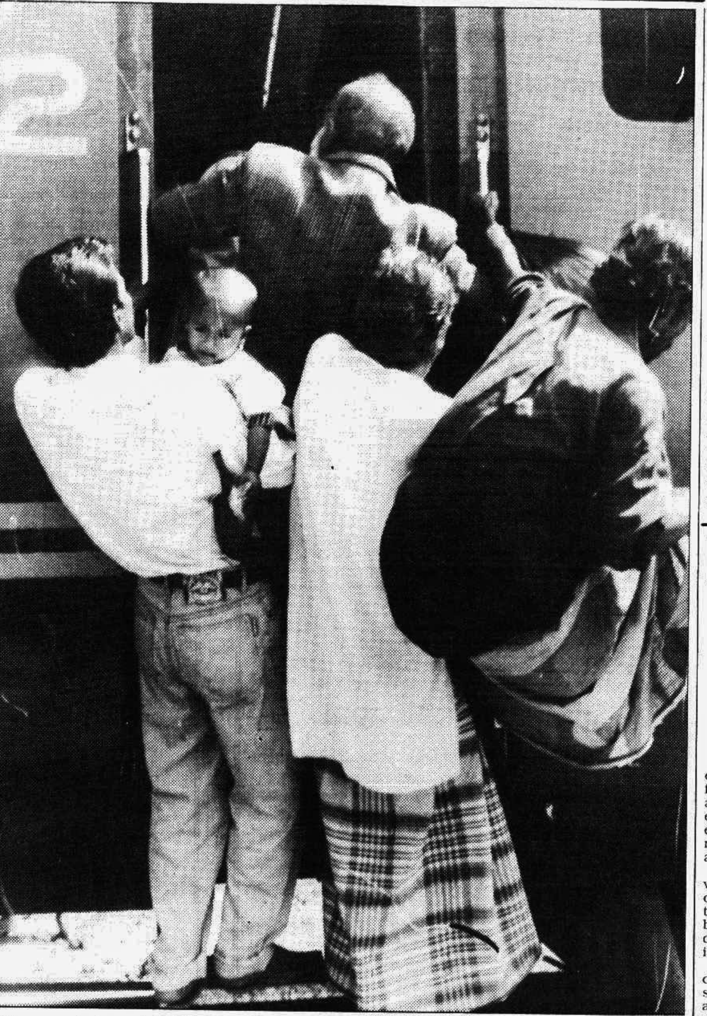
Who wants to get left behind? Thousands leave the city as a virtual nine-day holiday started yesterday with the weekend followed by Shaheed Day, only one working day, opposition-called three-day hartal and another weekend. The photo shows home-bound people jostling to get into a train at Tongi station.