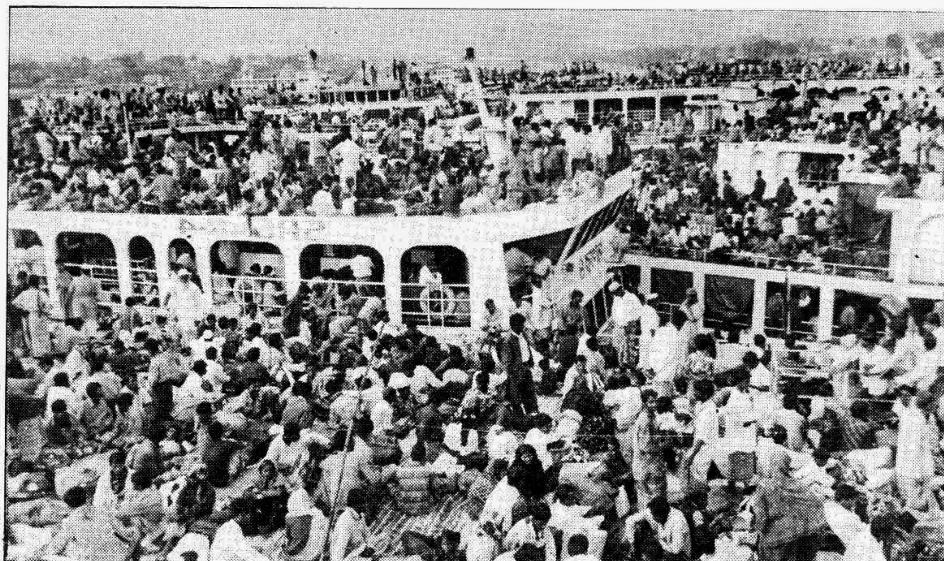
THE EID IS NEAR: Home-bound people in their thousands crowding the terminals of all modes of transport in the city. This picture was taken from the Sadarghat launch terminal yesterday.

"The government has a firm resolve to enforce Islamic laws all over the country," he said.