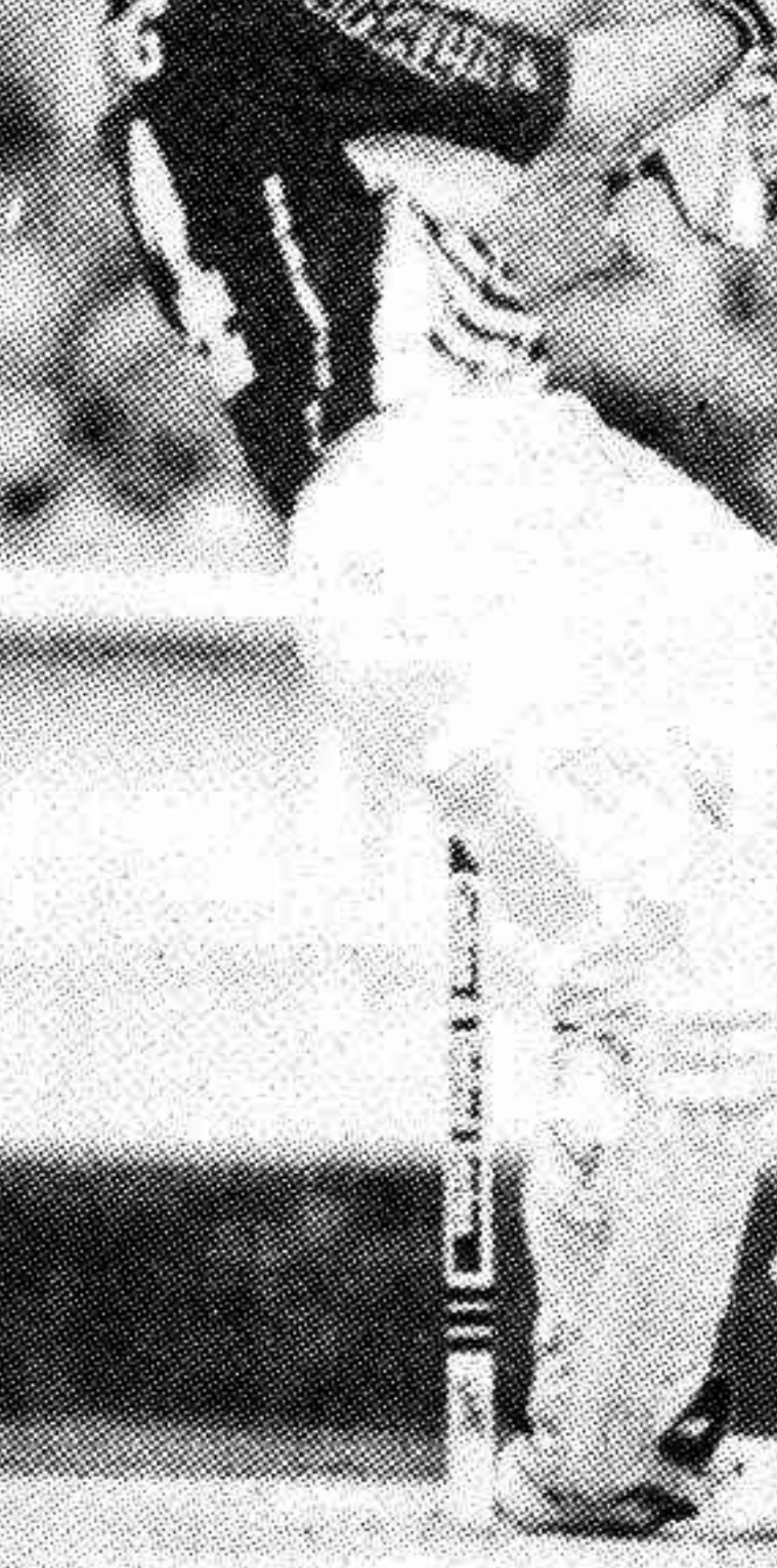
Ricky Ponting pulls during his unbeaten 75 against England yesterday.