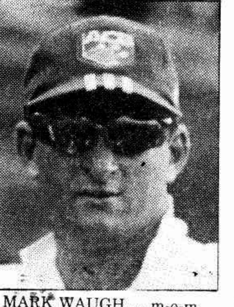
MARK WAUGH ... m-o-m

"The public has to urge these people that matches, be they of cricket, hockey or any other sport, should be played in their true spirit and should not be disrupted."