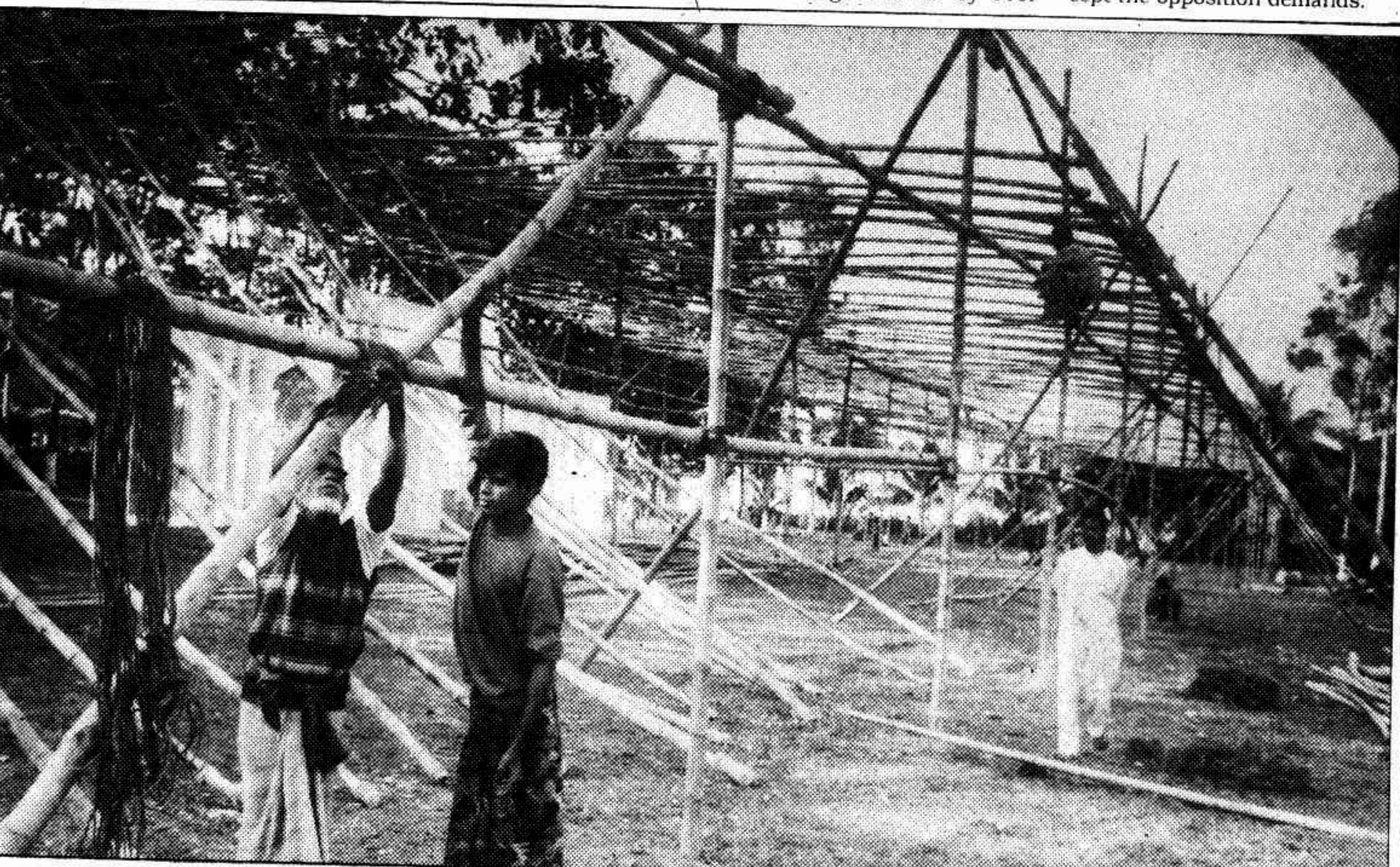
Preparations underway to hold the main Eid congregation at the National Eidgah on the High Court premises in city. Picture shows bamboo structures being made to erect pandals.

Published by the Editor from City Publishing House Ltd., 90 Kakrail, Dhaka-1000 on behalf of Mediaworld Ltd., 52 Motijheel C.A., Dhaka-1000. Editorial, News & Commercial Offices: House No: 11, Road No: 3, Dhanmandi R/A, Dhaka-1205. PABX: 866772-4, Commercial: 866771, Fax No: 88-02-863035, GPO Box No: 3257, Cable: DAILYSTAR, DHAKA. Internet edition address: http://www.dailystarnews.com and Email address: dstar@bangla.net