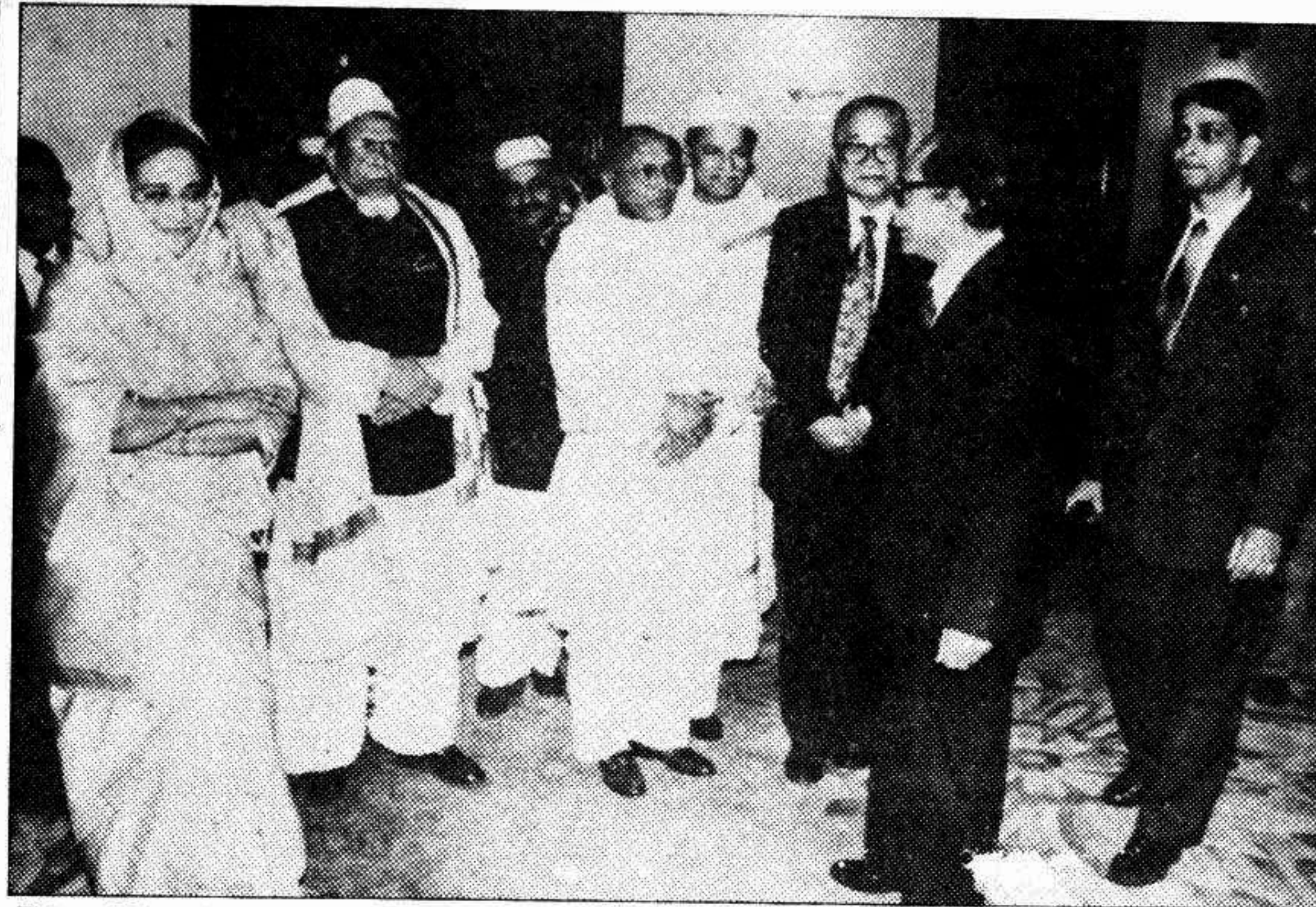
Prime Minister Sheikh Hasina and her Cabinet colleagues attended an iftar party hosted by President Shahabuddin Ahmed at Bangabhaban yesterday.

Nepal's politics has been in turmoil since the 1994 election left no single party with a clear majority in parliament.