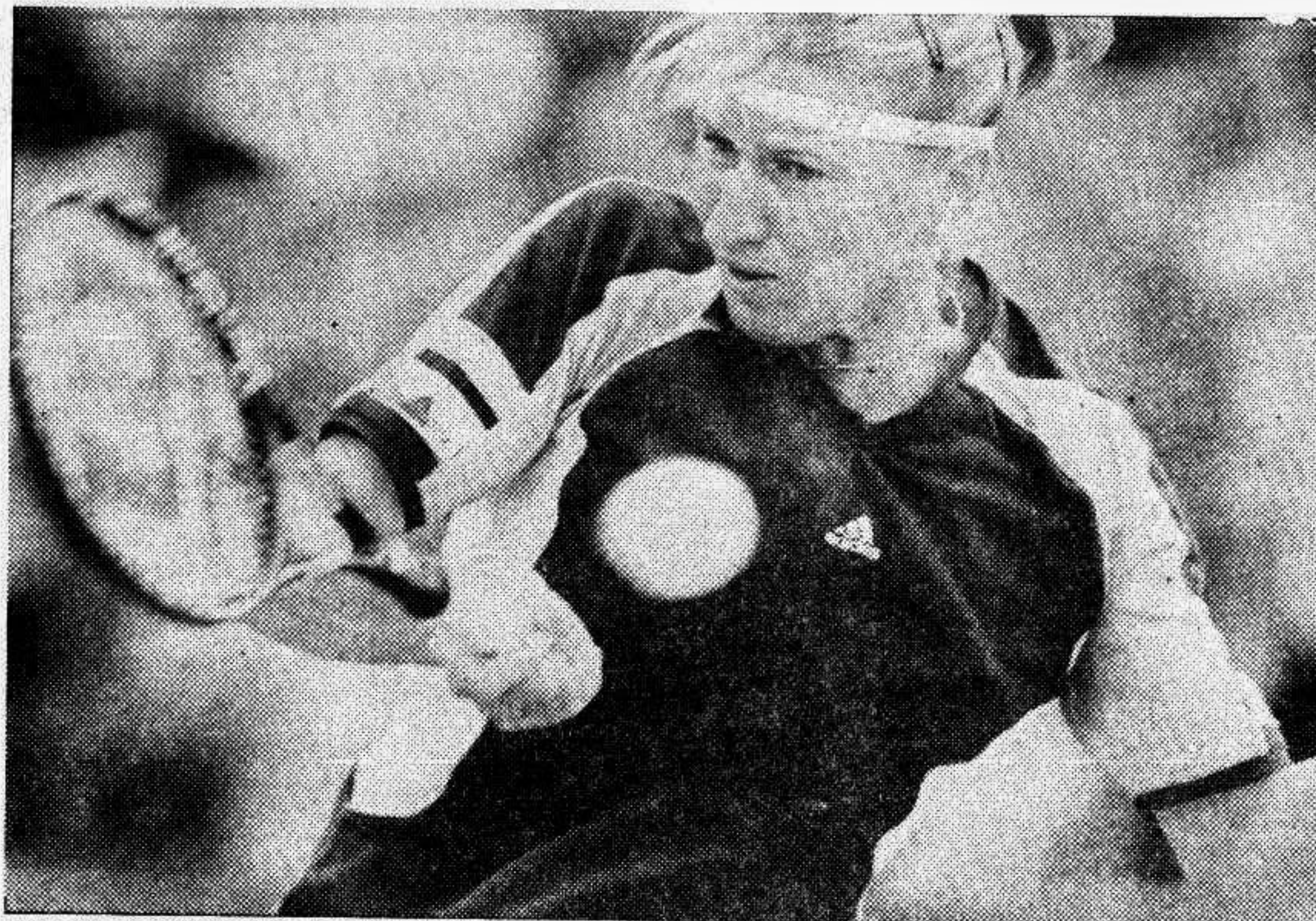
Steffi Graf playing against Venus Williams in the Sydney International yesterday. Graf triumphed 4-6, 6-2, 6-4.

In other cup games, Villareal won 3-1 against Seville and advanced on an aggregate score of 5-3.