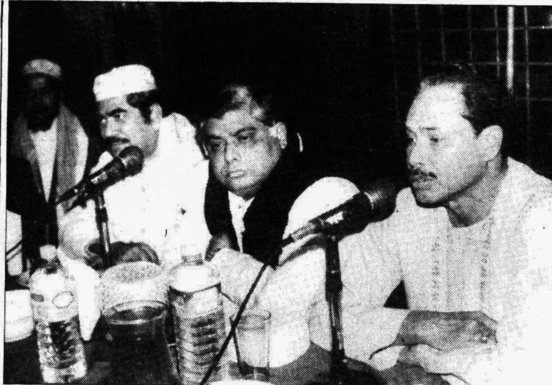
Jatiya Party chief HM Ershad speaks prior to an iftar party he hosted for journalists at a city hotel yesterday.

Published by the Editor from City Publishing House Ltd., 90 Kakrail, Dhaka-1000 on behalf of Mediaworld Ltd., 52 Motijheel C.A., Dhaka-1000. Editorial, News & Commercial Offices: House No. 11, Road No. 3, Dhanmandi R/A, Dhaka-1205. PABX: 866772-4, Commercial: 866771, Fax No: 88-02-863035, GPO Box No: 3257, Cable: DAILYSTAR, DHAKA. Internet address: dstar@bangla.net