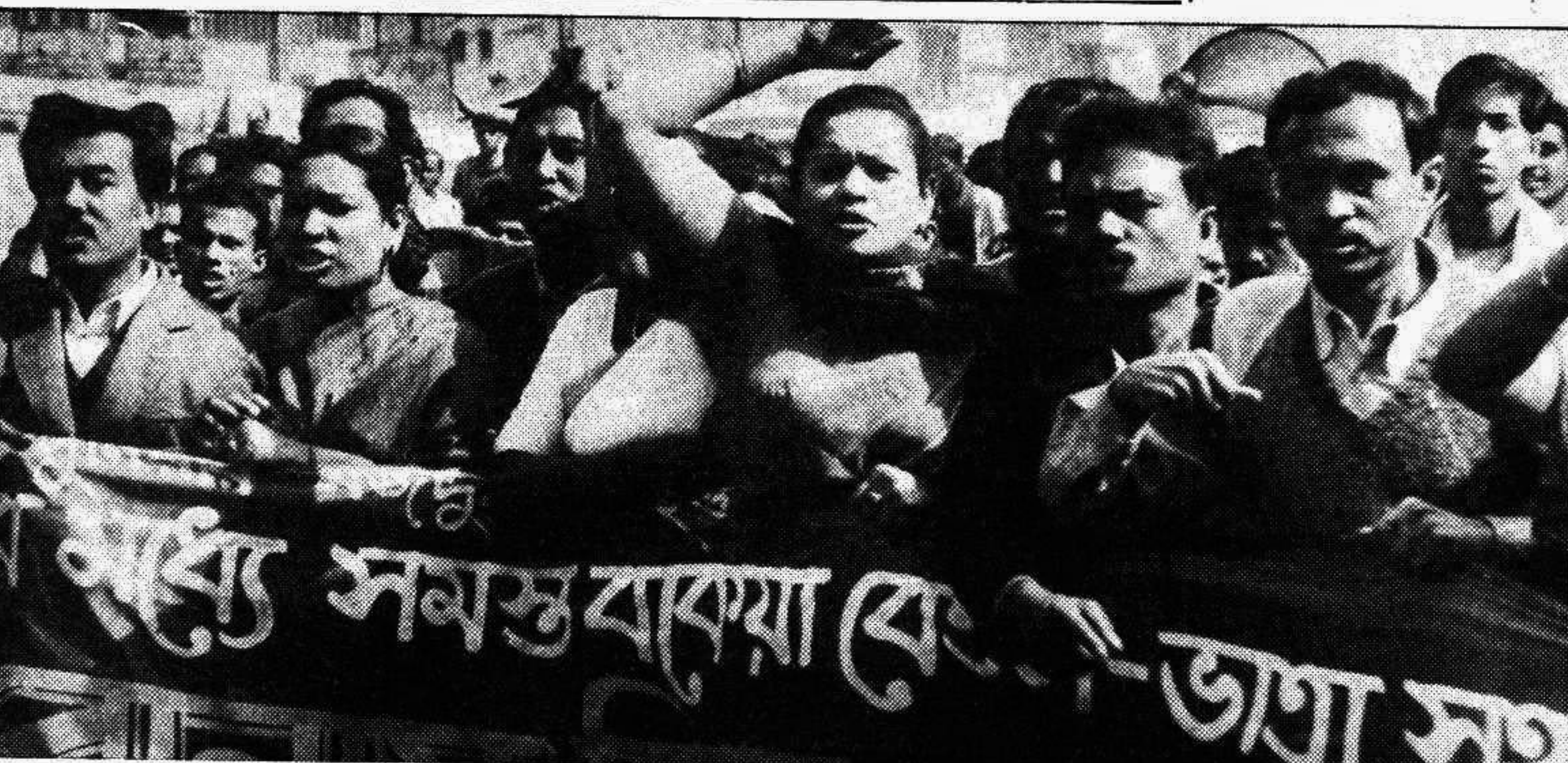
Bangladesh Garments Sramik Oikya Parishad brought out a procession in the city yesterday demanding payment of arrears wages and Eid bonus before the Eid-ul-Fitr.

"There are many loopholes in the DSE articles and settlement rules. After automation, the DSE rules should have been changed and brought in line