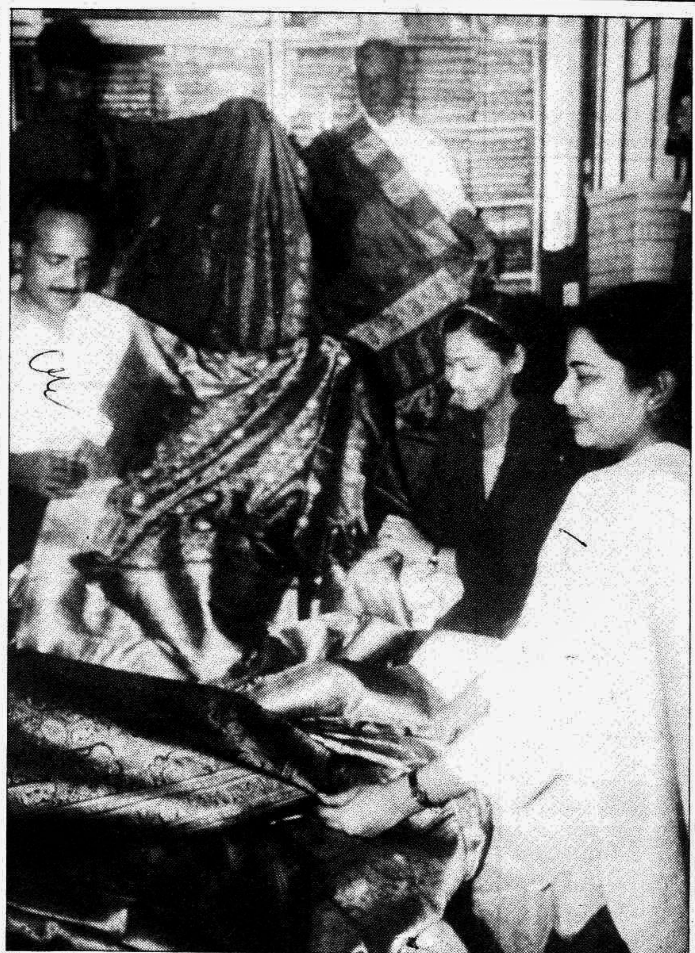
Very attractive but prohibitive price! Eid shopping is at the pick now with only few days left for the festival. The photo was taken from a shop at New Market in the city yesterday.

Counter staff said that almost all tickets from January See Page 12 Col 8