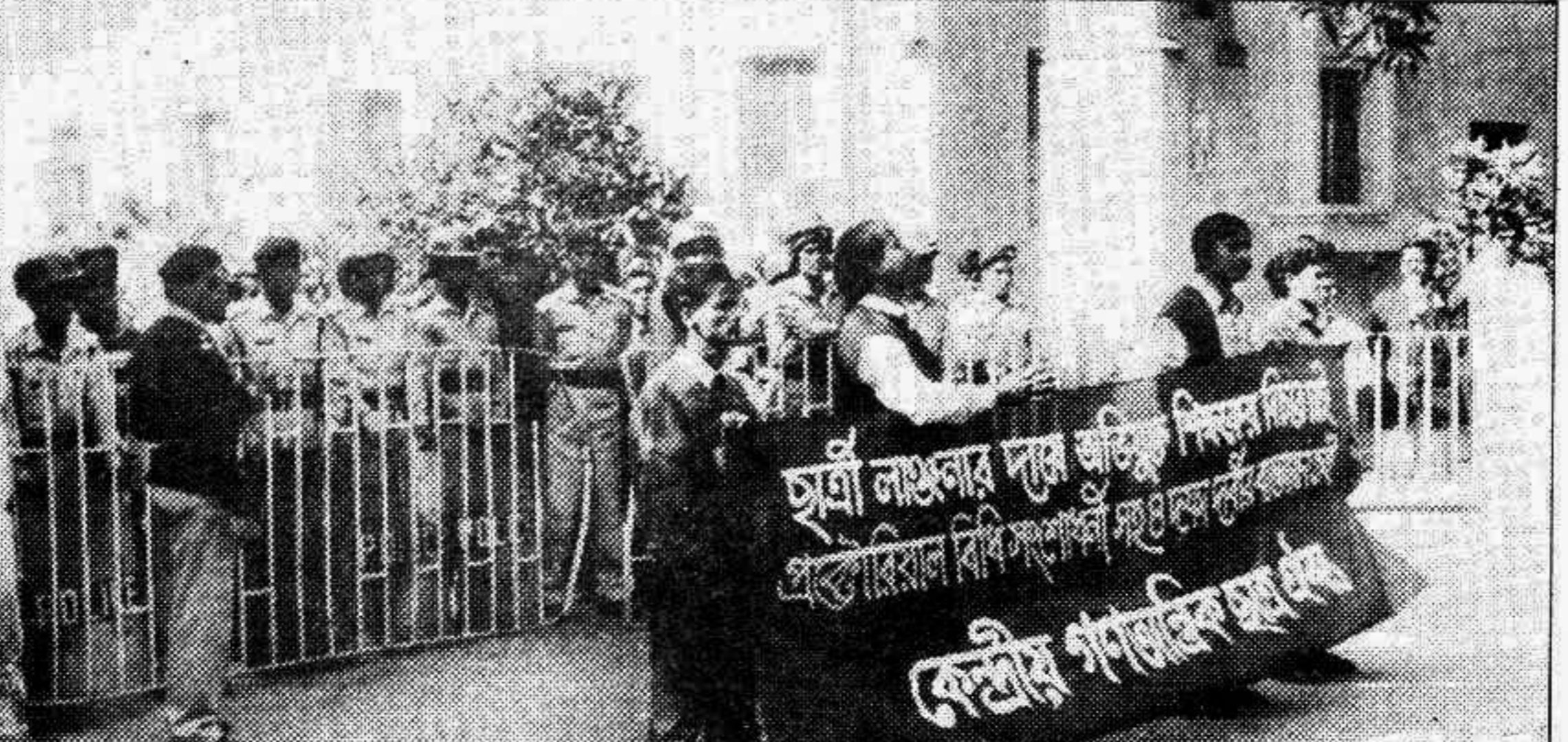
Chhatra Oikya Forum, Jatiya Chhatra Oikya and Biplobi Chhatra Oikya demanded action against the DU teacher accused of sexual abuse.

The truck driver managed to flee with his vehicle. A case was lodged with the police.