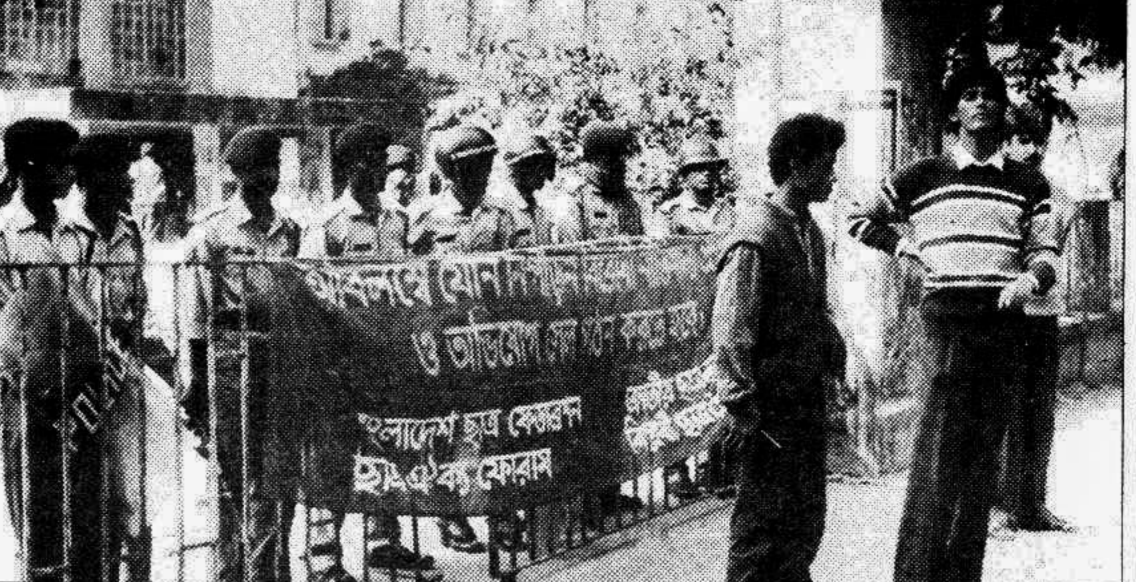
Bangladesh Chhatra Federation, Chhatra Oikya Forum, Jatiya Chhatra Oikya and Biplobi Chhatra Oikya brought out a procession on the DU campus yesterday demanding formulation of a code of conduct for educational institutions.