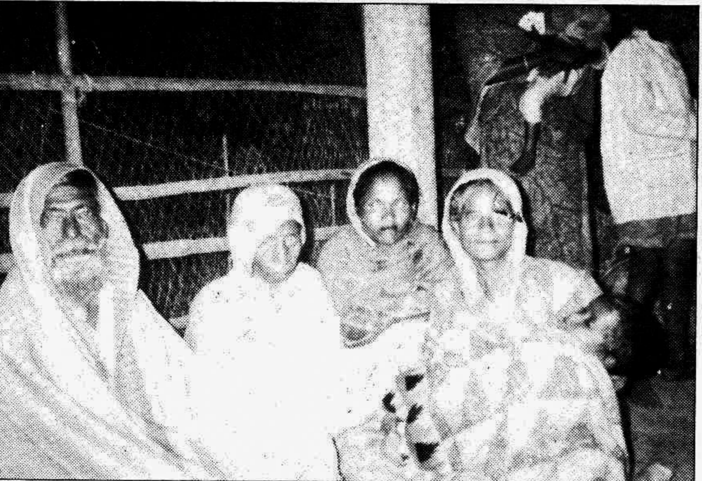
BARISAL: Shelterless people passing their night in severe cold under the shed of a building here.

BARISAL, Jan 11: With the advent of winter season miseries of lakhs of helpless and shelterless people have increased. The well-to-do people who have enough money can buy necessary clothes to protect themselves from the biting cold.