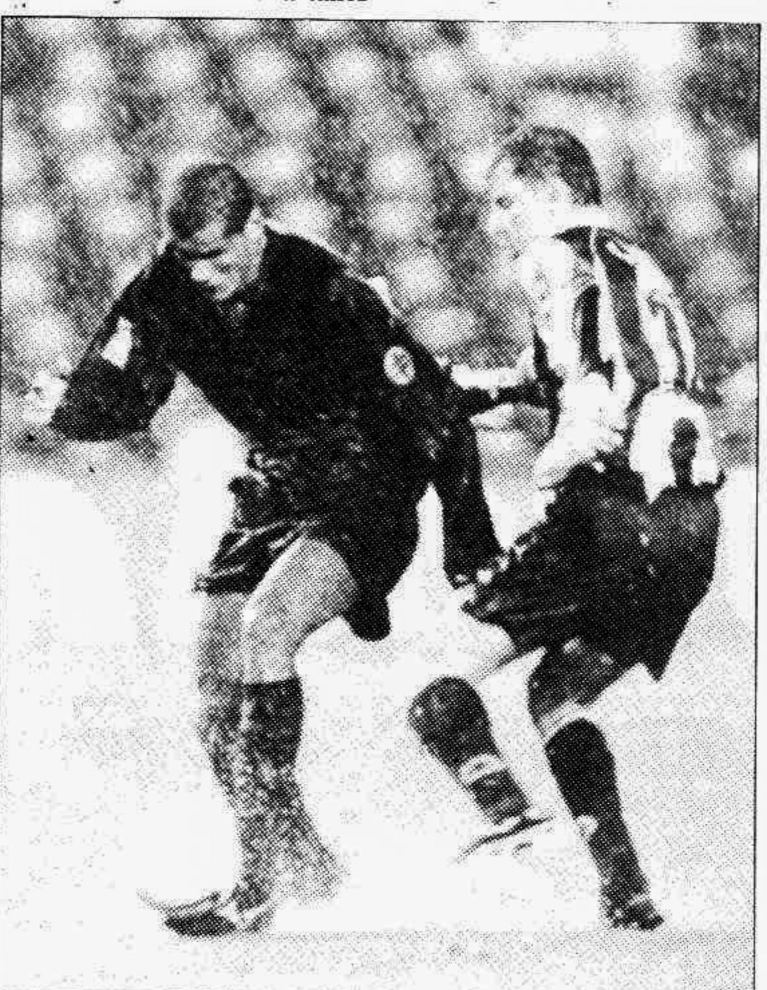
RAIN MAN! Rivaldo (L), Barcelona's Brazilian superstar keeps control of the ball under pouring rain while an Athletic Bilbao defender tries to intervene during their Spanish Premier League clash at Barcelona on January 9. Barca won 4-2.