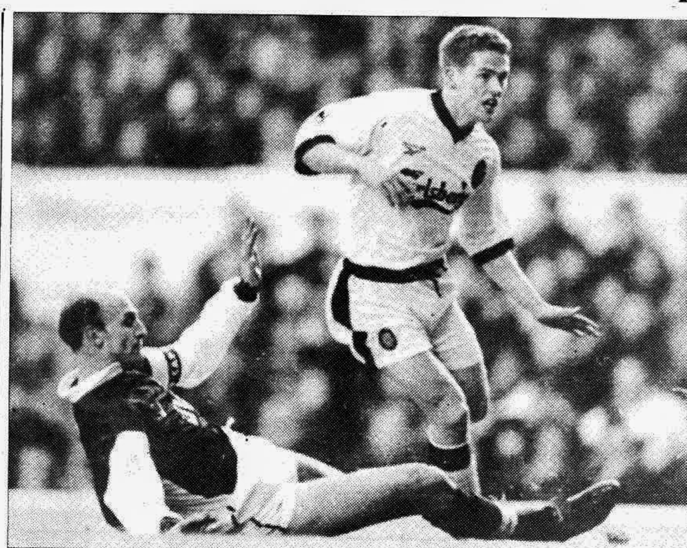
Liverpool's ace marksman Michael Owen being tackled by Arsenal captain Steve Bould during their English Premiership match at Highbury on January 9. The game ended 0-0.