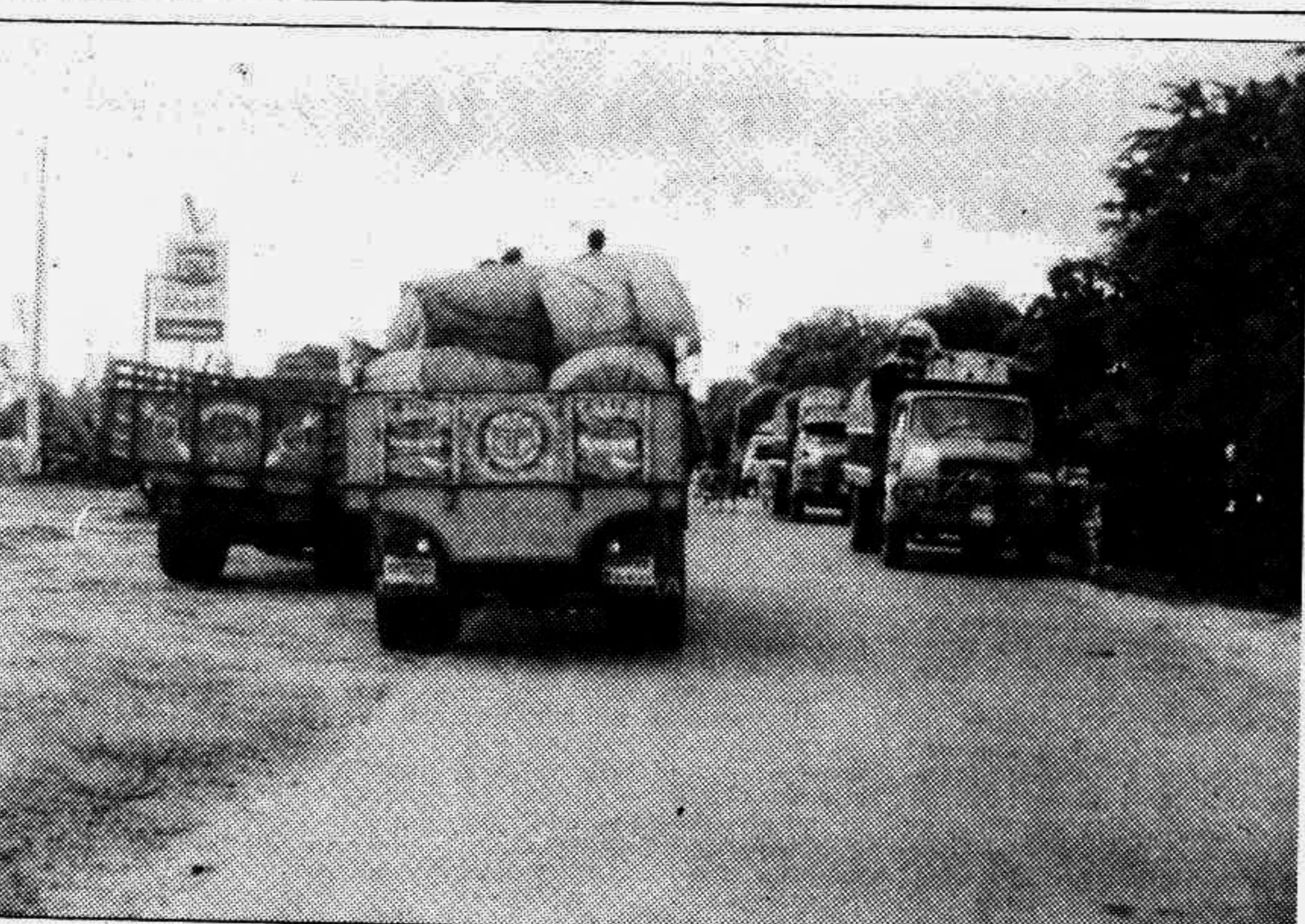
JHENIDAH: Plying of vehicles are being hindered greatly as truck drivers park their vehicles frequently on busy roads here.

on quality. A survey conducted by the local Forest Department revealed that there are some 20,000 date-palm trees in 10 thanas. A good number of people are engaged in collecting and selling the juice thereby maintaining their families.