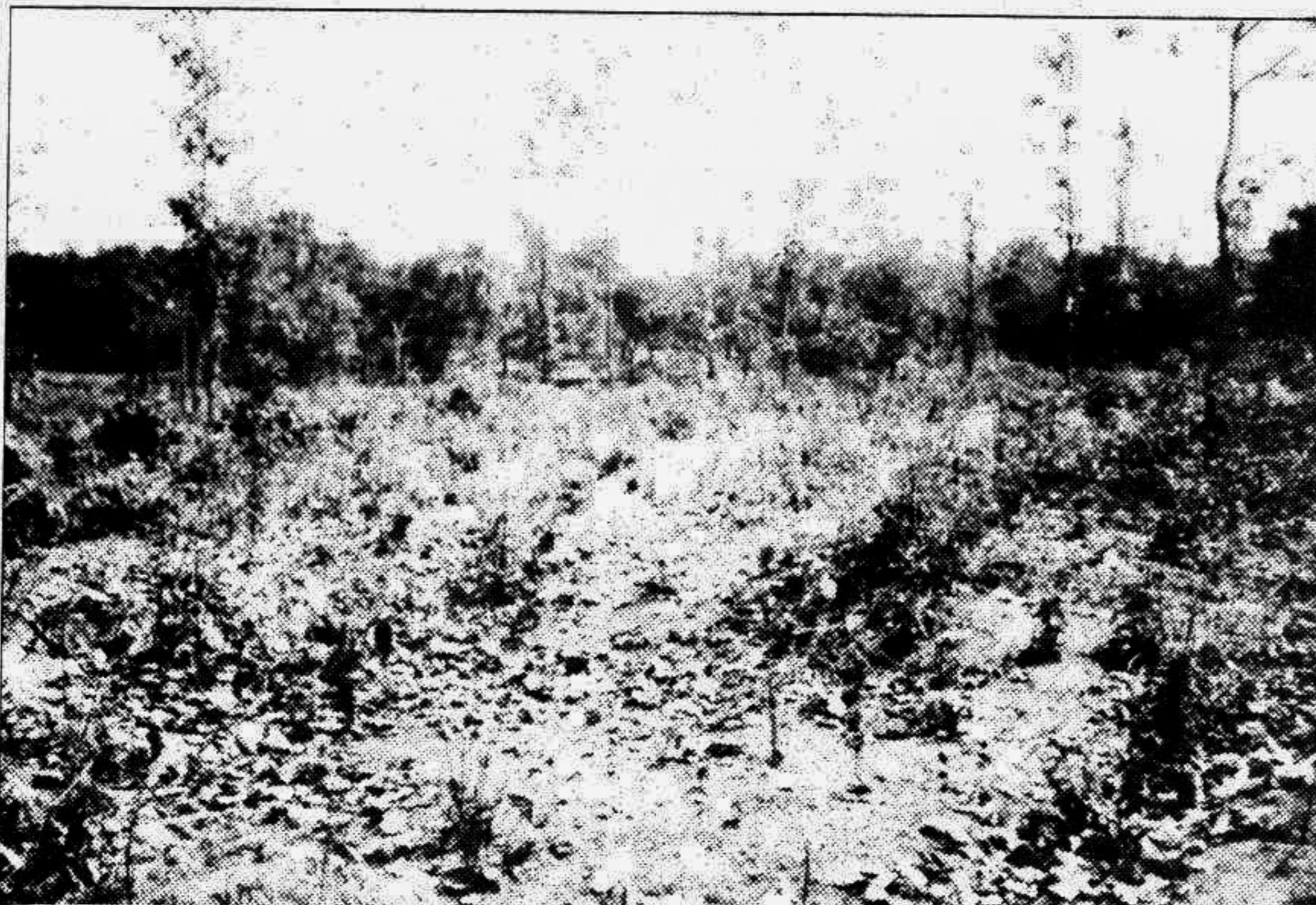
MYMENSINGH: A view of denuded forest land at village Habirbari in Bhaluka thana.

in Habirbari union of Bhaluka thana. Forest officials also said due to lack of sufficient forest guards in different parts of forest region lifting activities are increasing.