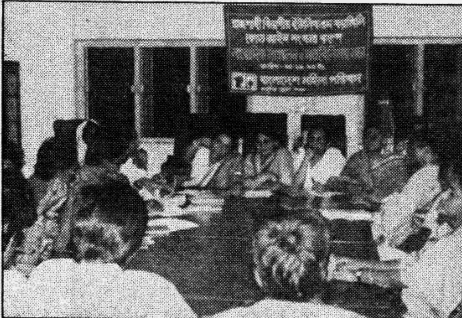
NATORE: Leaders of Bangladesh Mohila Parishad exchanging views with the journalists recently. They exchanged views on uniform family code law reforms.

The TLM programme, guided by Gazipur district administration, started in 1,164 schools in different villages under 44 unions and two municipalities. The movement aims at ensuring 100 per cent literacy in the district within 1999. The organisers recently appointed teachers for running TLM courses in selected 1,164 schools.