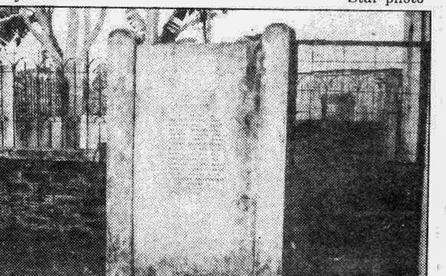
JHENIDAH: A graveyard where seven martyrs of the Liberation War are sleeping. It remained unprotected for a long time. Recently Sailkupa thana administration has given a fencing around it.