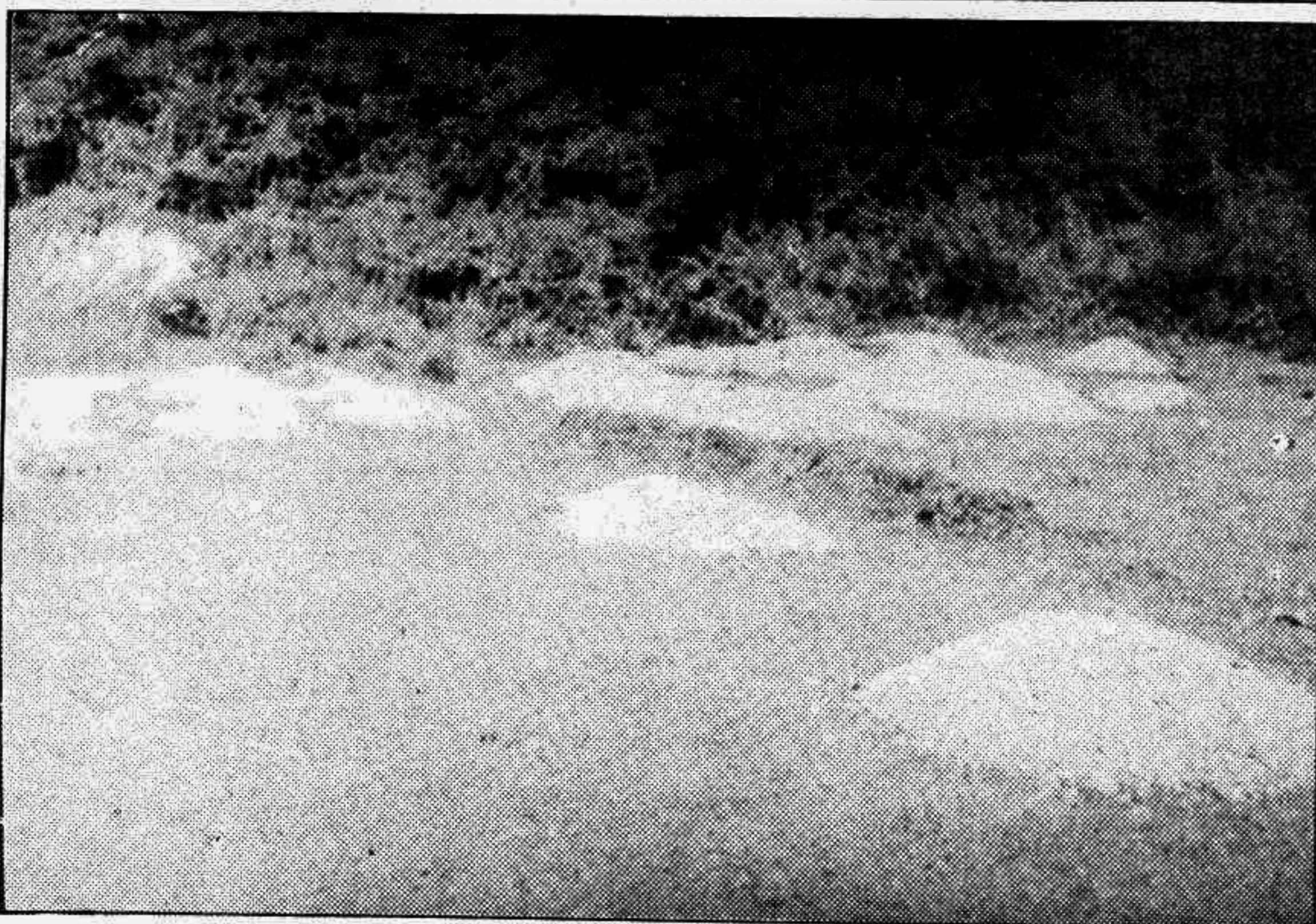
SHERPUR: Valuable white stones are being wasted due to lack of proper maintenance. Local people usually collect stones through unscientific methods. Afterwards they pile it up on land in a careless manner. The picture was taken recently from Garo hills in Jhenaigati thana.

But fact remains that investigation of murder cases have been making any headway.