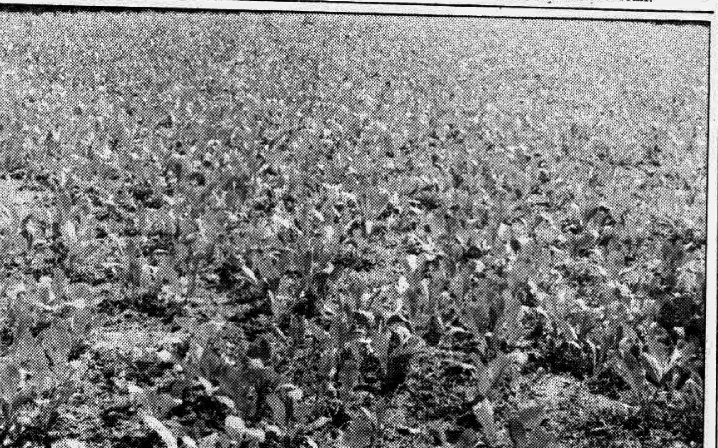
MYMENSINGH: A massive winter vegetables cultivation programme has been taken up recently in Trishal thana.

A farmer of Laxmiganj village of Sadar thana said his tomato and wheat fields have been invaded by the pest for the last 20-25 days and the prospect of good harvest is bleak.