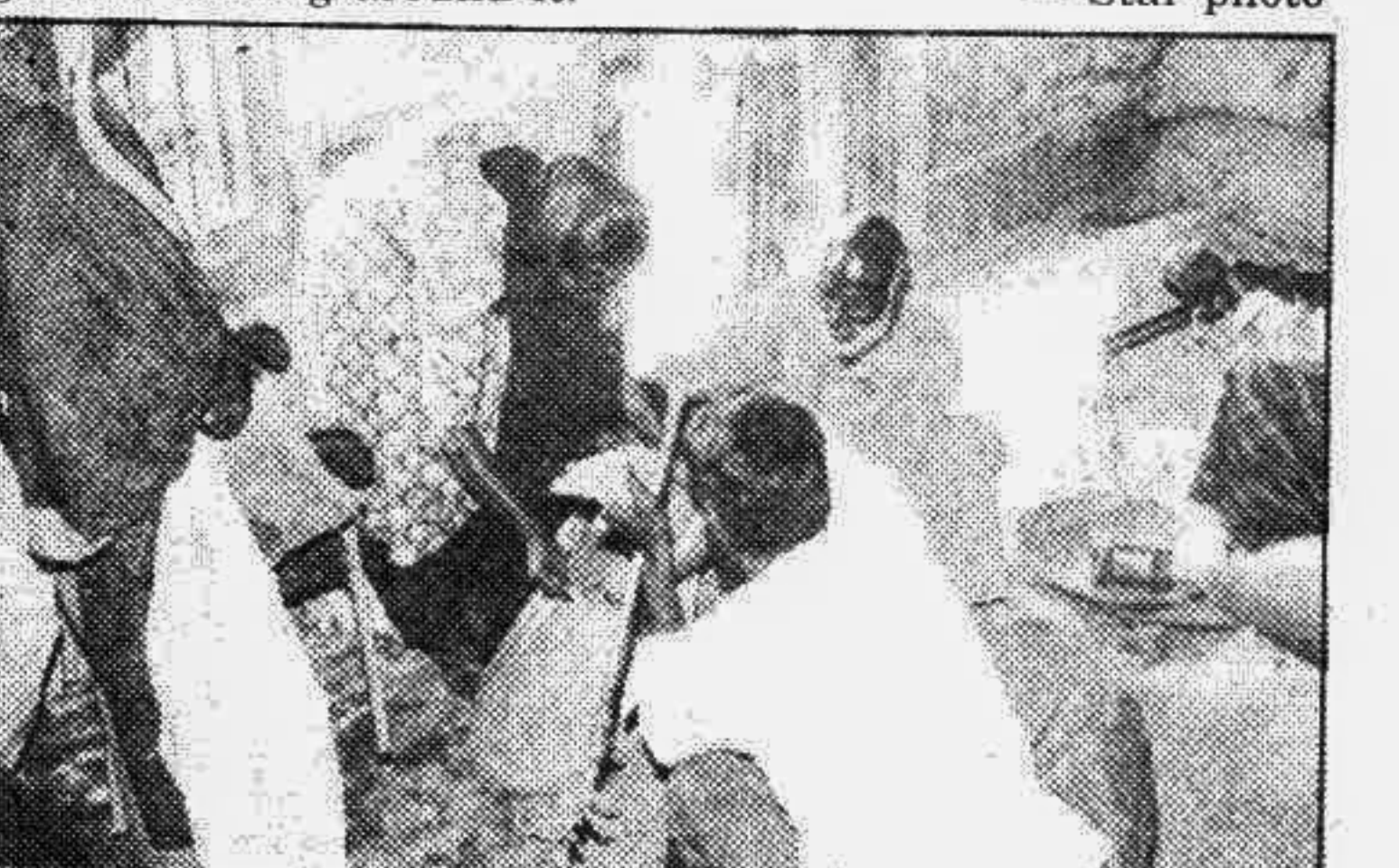
JHENIDAH: VGF wheat being distributed among the distressed people recently at Bogura Union Parishad.