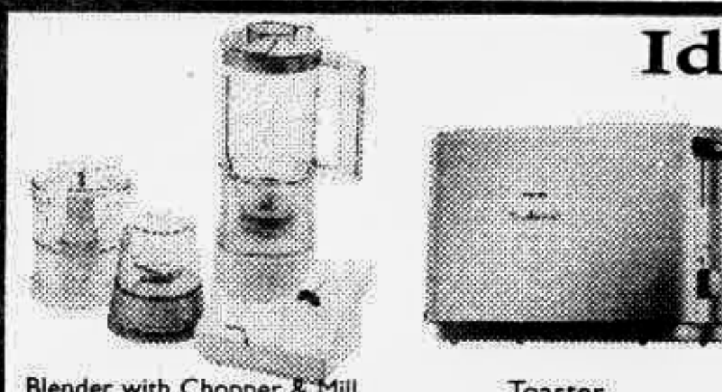
Blender with Chopper & Mill

Visit your nearest Philips Display Centre today