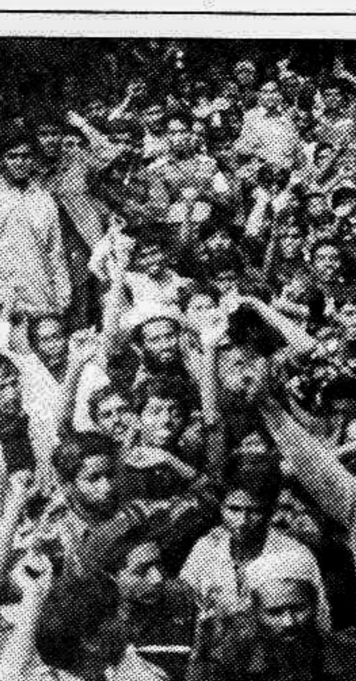
Hawkers brought out a procession in the city yesterday protesting their eviction from Farm Gate area.