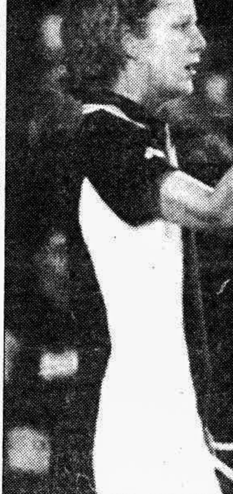
Sweden's Jonas Bjorkman and his teammate Asa Carlsson celebrate their victory over Switzerland in the Hopman Cup in Perth on January 8.

Sweden's Jonas Bjorkman and his teammate Asa Carlsson celebrate their victory over Switzerland in the Hopman Cup in Perth on January 8.