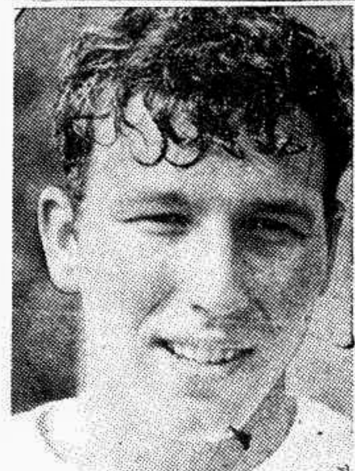
Michael Atherton (Former England cricket captain)

"I don't believe in professional cricket except for the elite. Our system breeds poor human beings and soft cricketers."