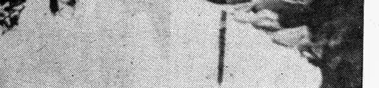
CHANDPUR: Chandpur-Comilla road has been damaged very badly near Haziganj causing serious threat to traffic movement.

He, however, declined to comment on the allegations of corruption, nepotism and irregularities.