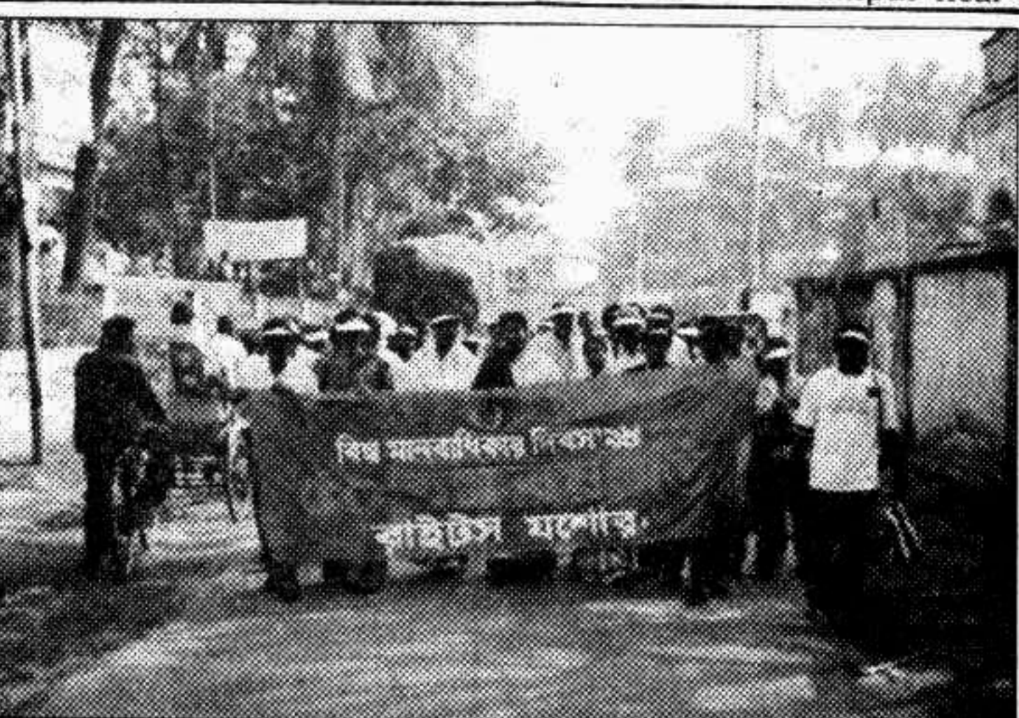
JESSORE: Rights Jessore brought out a colourful procession here recently on the occasion of World Human Rights Day '98.