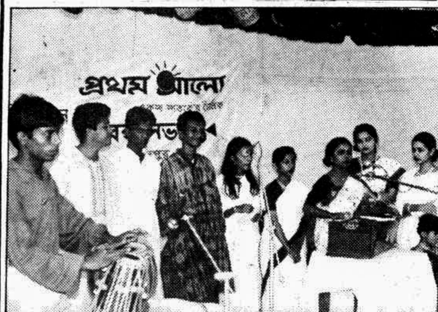
CHANDPUR: Readers Forum of Prothom Alo, a leading national daily arranged a cultural programme here recently.