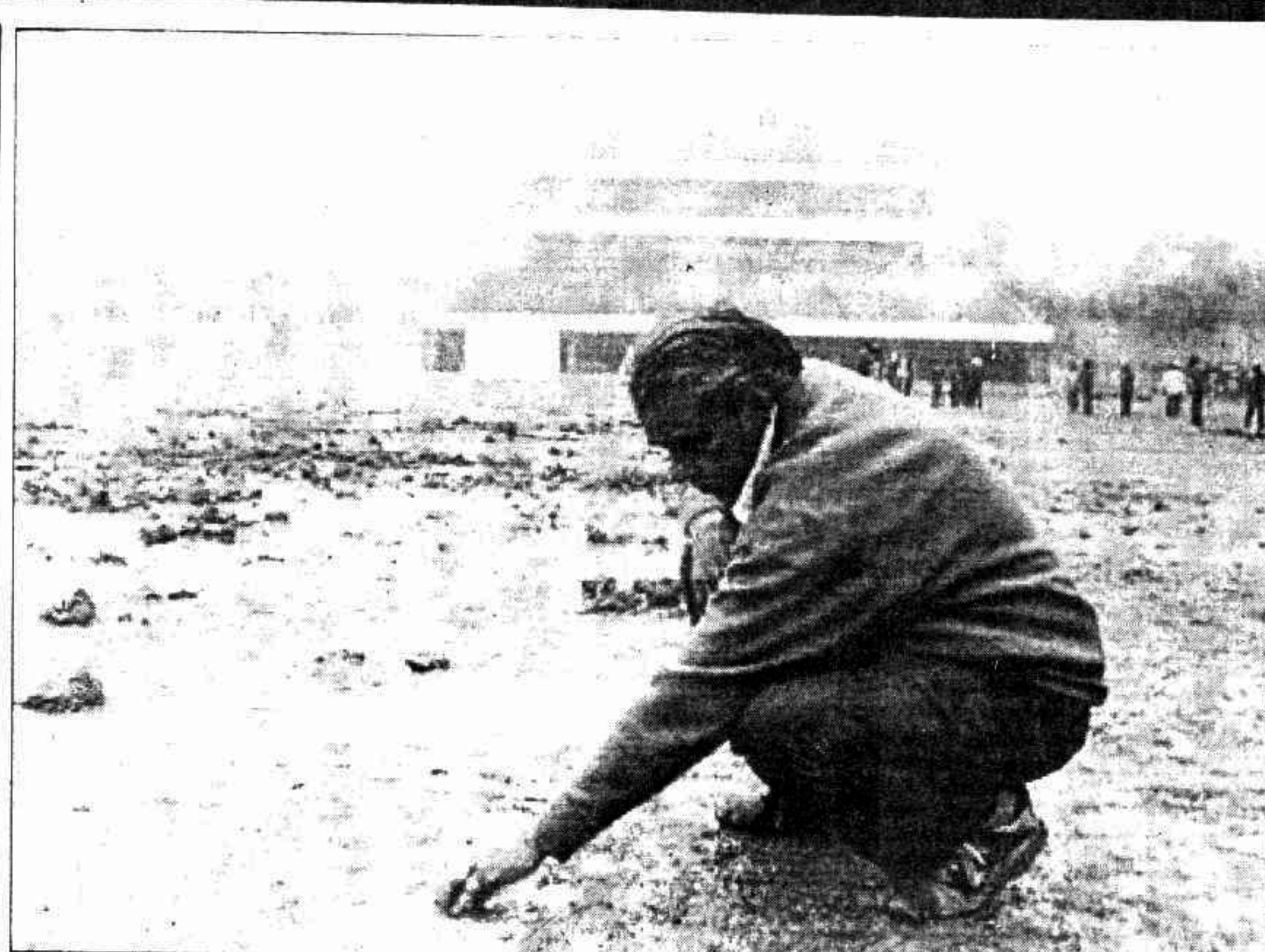
PATHETIC: A groundsman inspects the Ferozeshah Kotla pitch at Delhi which was dug-up by radical Shiv Sena activists.

"We are sending a delegate to India, who along with the Pakistan High Commission, will assess the extent and nature of the threat," he said. Pakistan still planned to go ahead with the tour.