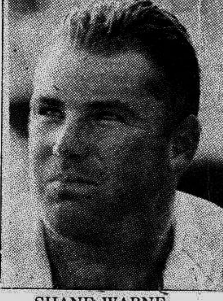
SHANE WARNE the decisions on Warne and Mark Waugh when naming a 14-man squad for the first five games. But the move had to be ratified by the ACB, which has stated it does not believe the two tainted players should receive any further punishment. The pair will be back in the spotlight for their bookie deal-

taincy aspirations after the final Test of the Ashes series finished in Sydney on Tuesday. "There has been a lot of talk that he should not captain because of the bribery issue," said Taylor. "But I think he just made a mistake and everybody is entitled to make a mistake." Australia's selectors made