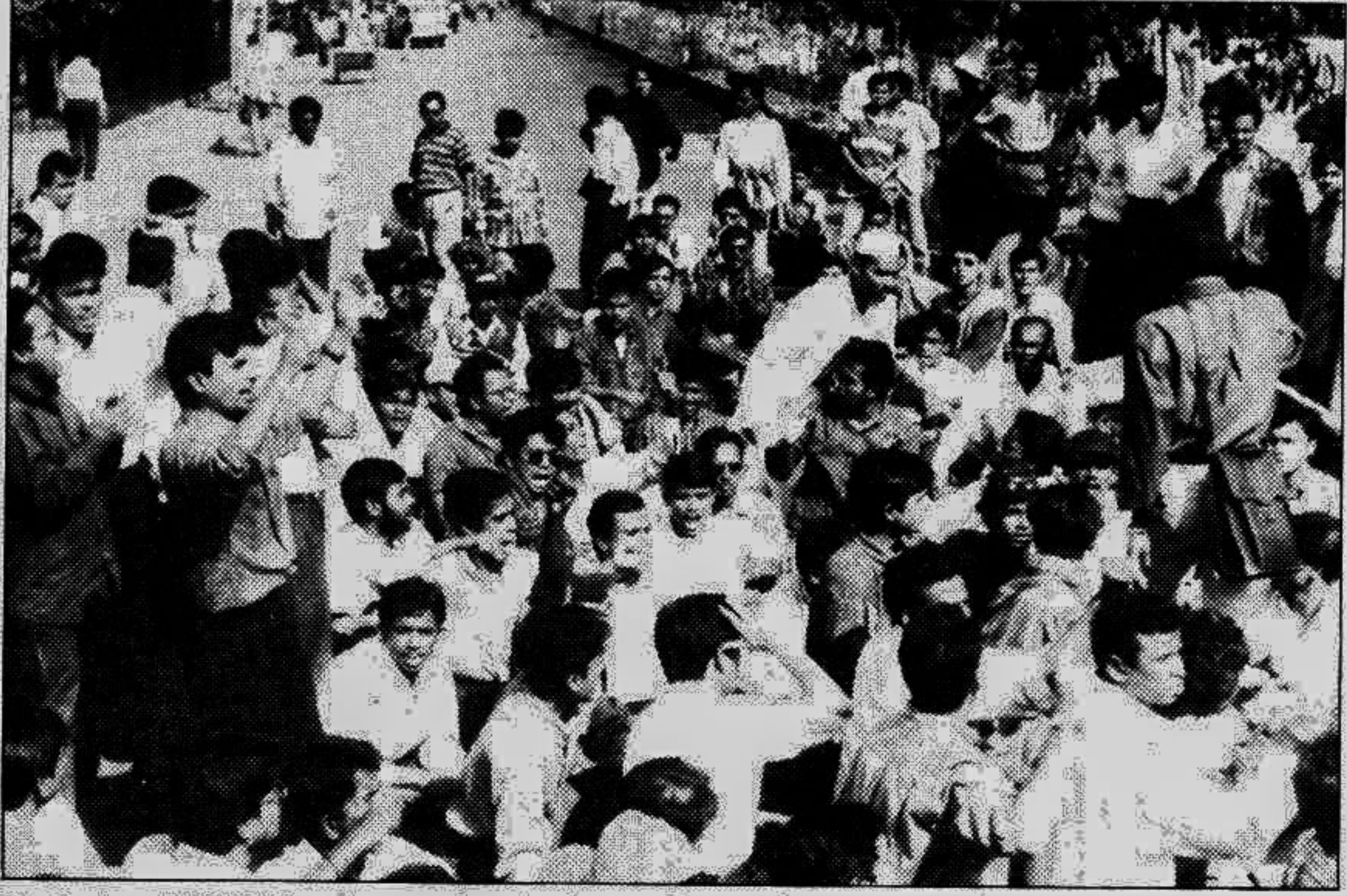
Students of ICMAB put up a barricade on the road in front of the institute in Nilkhet yesterday to press home their demands.