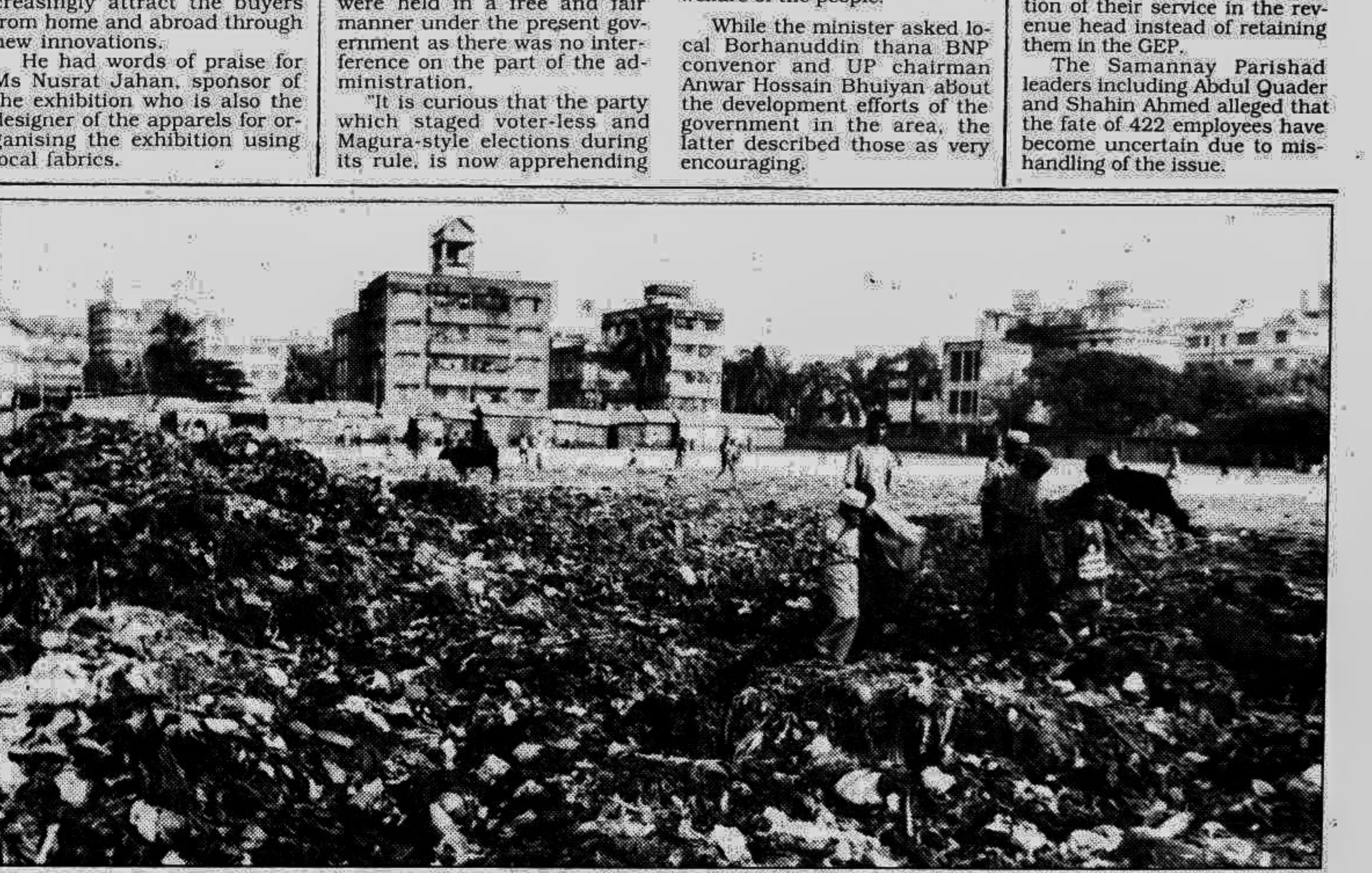
A DEPOT OF NEGLIGENCE: The picture shows what remains of the Maghbazar-Madhuhag playground. Local residents allege that turning the field into a garbage dump is having a serious effect on the environment of the area. They have urged the DCC to clear up the place as soon as possible.