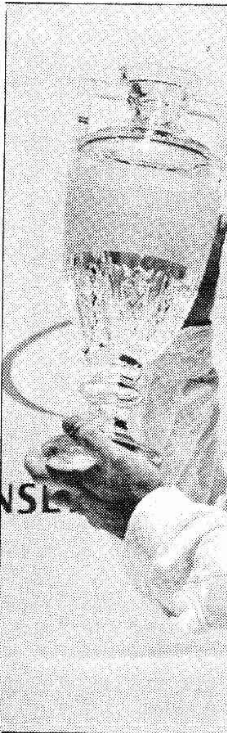
A PROUD MOMENT: Australian skipper Mark Taylor with the new-look Ashes Trophy.

until after the World Cup in midyear and he said he hoped he and coach David Lloyd would continue the partnership after that limited-overs tournament.